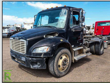
2005 FREIGHTLINER BUSINESS CLASS M2 S/A TRUCK TRACTOR