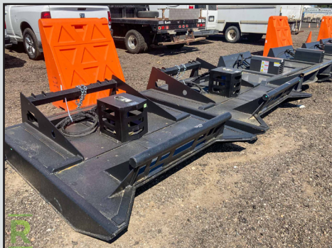
NEW SKID STEER BRUSH MOWERS