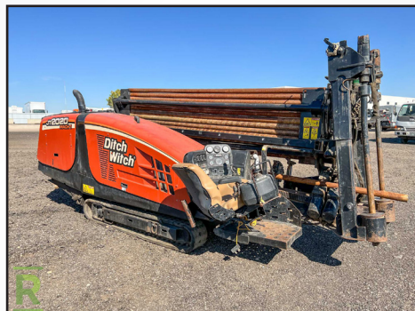
2007 DITCH WITCH JT2020 MACH 1 DIRECTIONAL BORING MACHINE