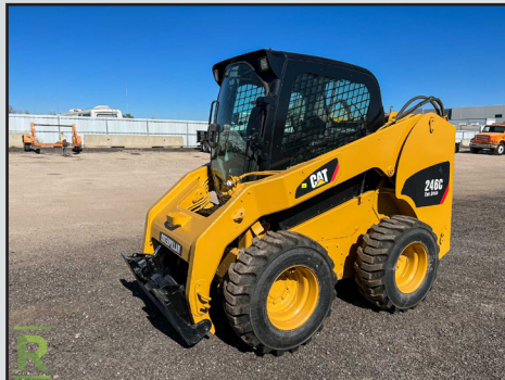
2012 CATERPILLAR 246C SKID STEER LOADER W/ 1017 HOURS