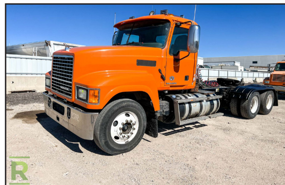
2012 MACK CHU613 T/A TRUCK TRACTOR W/ MP8, COUNTY UNIT