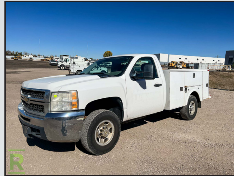
2010 CHEVROLET SILVERADO 2500 4X4 UTILITY TRUCK

1999 T/A Reel Trailer, (3) Reels, Rear Pneu. Reel Lift