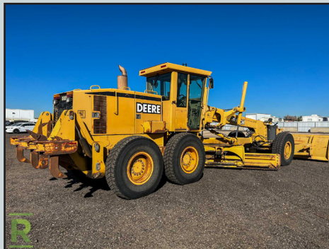
1998 JOHN DEERE 772CH 6WD MOTOR GRADER, CITY UNIT