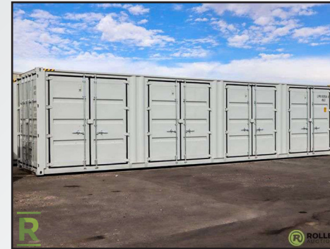
NEW 40' STEEL STORAGE CONTAINER, HIGH CUBE