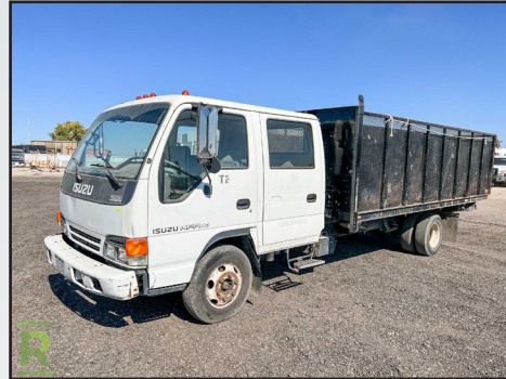
2005 ISUZU NPR FLATBED TRUCK, (1 OF 2)