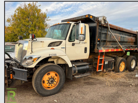
2008 INTERNATIONAL 7400 T/A DUMP TRUCK, CITY UNIT