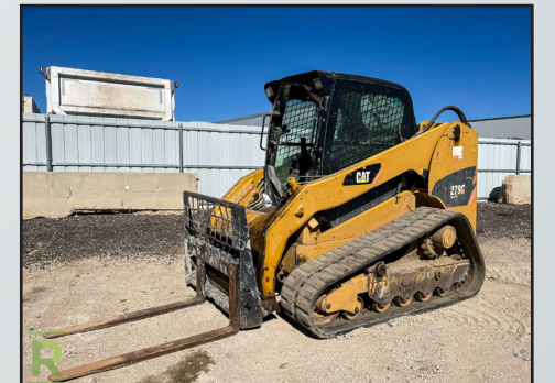
2009 CATERPILLAR 279C CRAWLER SKID STEER LOADER