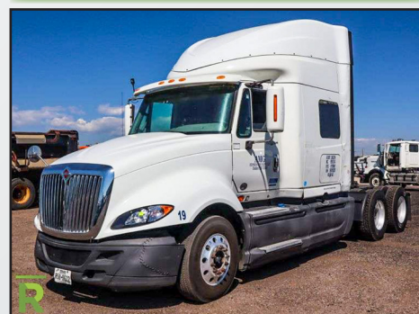
2014 INTERNATIONAL PROSTAR T/A TRUCK TRACTOR