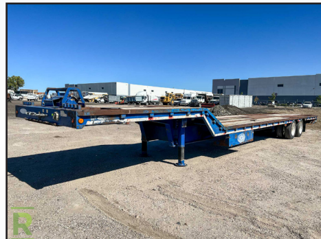
2006 LEDWELL HYDRAULIC TAIL TRAILER, 48' X 102"