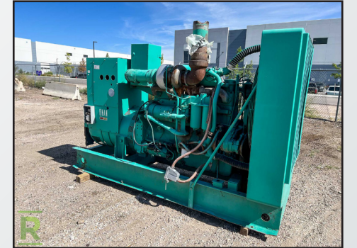
ONAN 200KW SKID MOUNTED DIESEL GENERATOR