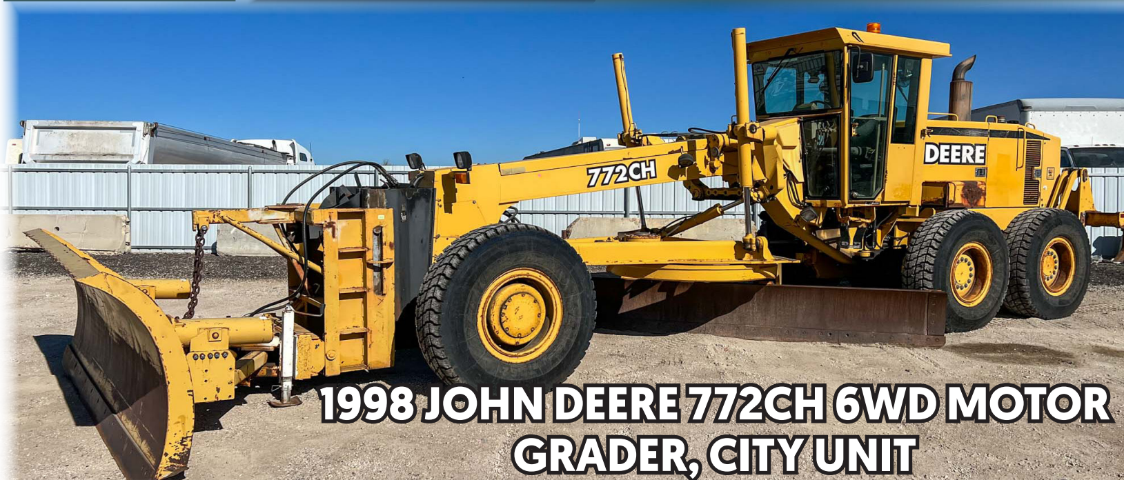
1998 JOHN DEERE 772CH 6WD MOTOR GRADER, CITY UNIT

Internet Only Auction • Bidding Available at: www.RollerAuction.com/construction