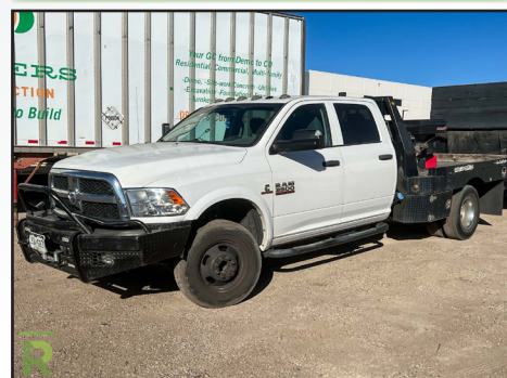
2015 DODGE HD RAM 3500 4X4 FLATBED TRUCK