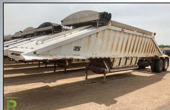
2008 MANAC SBD-240 T/A BELLY DUMP TRAILER, COUNTY UNIT

Inspection: November 7th & 8th from 8:15 a.m. to 4:45 p.m.