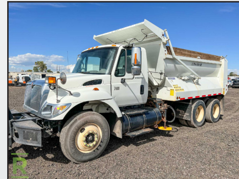
2005 INTERNATIONAL 7400 T/A DUMP TRUCK, MUNICIPALITY UNIT