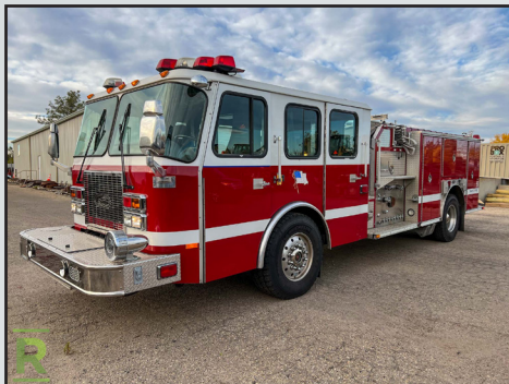
2001 EMERGENCY ONE PUMPER TRUCK W/ CUMMINS ISM, CITY UNIT