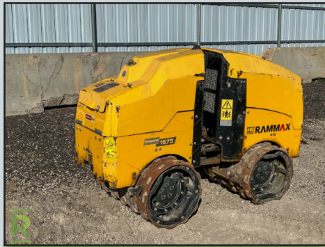
2016 RAMMAX 1575 TRENCH COMPACTOR