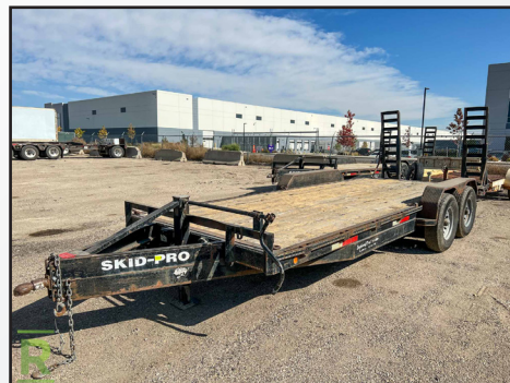
2007 DIAMOND T SKID PRO EQUIPMENT TRAILER