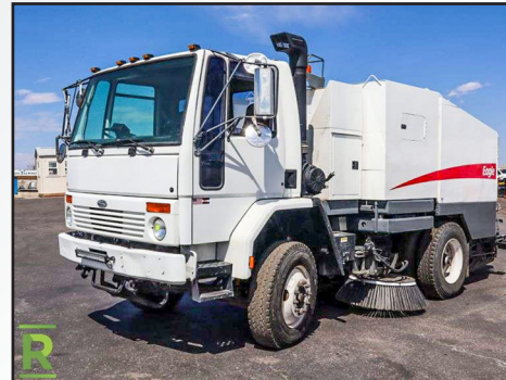
2006 ELGIN EAGLE STREET SWEEPER