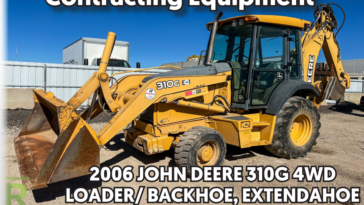
2006 JOHN DEERE 310G 4WD LOADER/ BACKHOE, EXTENDAHOE

7500 York Street • Denver, Colorado 80229 WEDNESDAY • November 9th • 9:00 A.M. Inspection: November 7th & 8th 8:15 a.m. to 4:45 p.m.