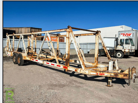
T/A REEL TRAILER W/ 3 REELS & PNEUMATIC REEL LIFT