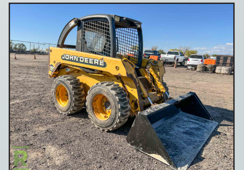
2000 JOHN DEERE 250 SKID STEER LOADER