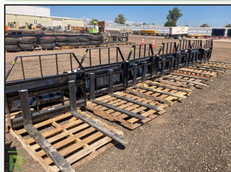
NEW FORK ATTACHMENTS FOR SKID STEERS