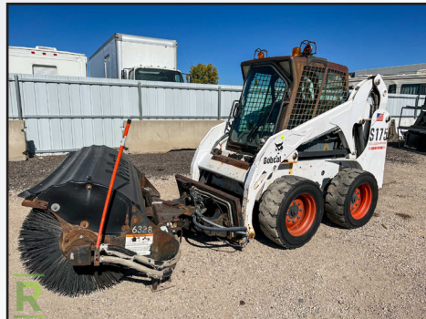
2002 BOBCAT S175 SKID STEER LOADER, COUNTY UNIT