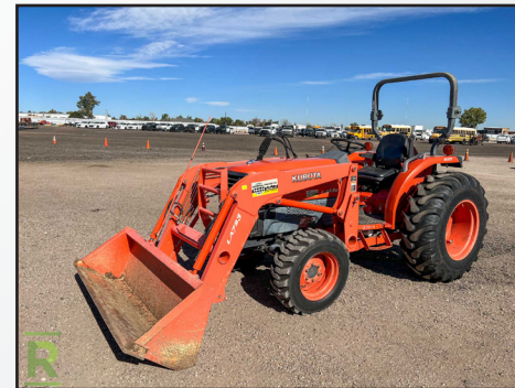
KUBOTA L3830 4WD TRACTOR/ LOADER

2007 Chevrolet Silverado 3500 4X4 Utility Truck,