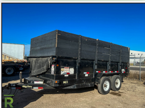
2015 BIG TEX HYDRAULIC DUMP TRAILER