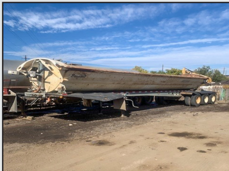
2007 SMITHCO TRI-AXLE SIDE DUMP TRAILER, (1 OF 2)