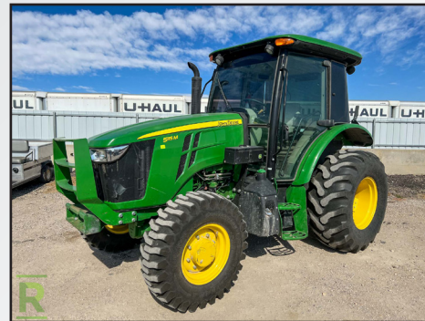
2018 JOHN DEERE 5115M 4WD AGRICULTURAL TRACTOR W/ 232 HOURS