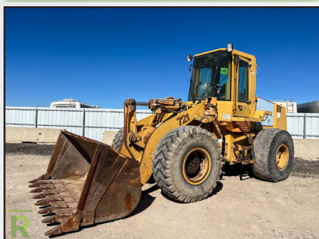
CASE 721 WHEEL LOADER