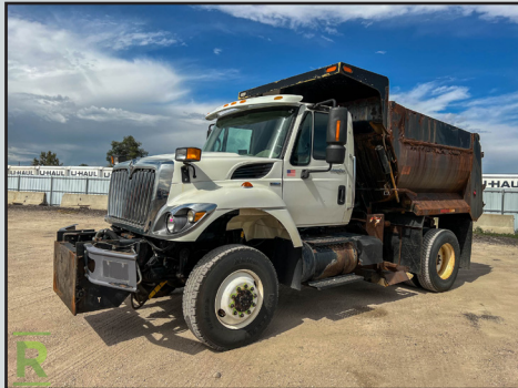
2009 INTERNATIONAL WORKSTAR 7500 4WD DUMP TRUCK, CITY UNIT