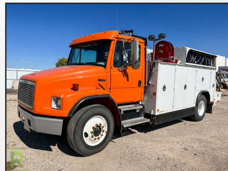
2001 FREIGHTLINER FL80 FUEL & LUBE TRUCK W/ CRANE, COUNTY UNIT