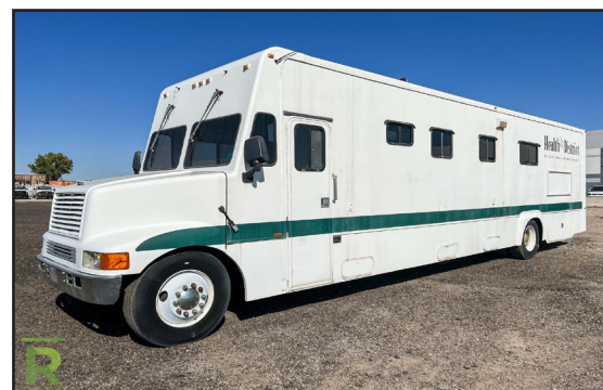
1996 INTERNATIONAL 3800 MOBILE OFFICE, COUNTY UNIT