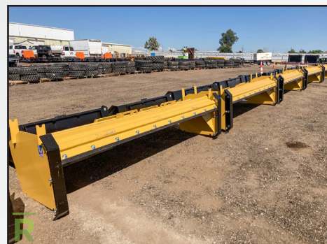
NEW SNOW PUSHERS FOR SKID STEERS