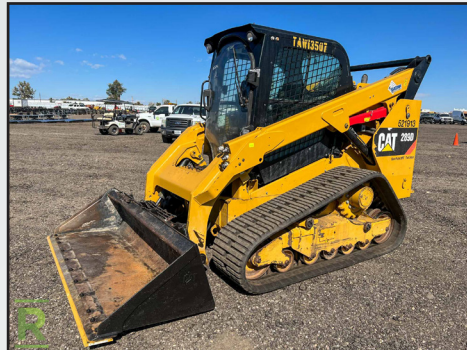
2019 CATERPILLAR 289D CRAWLER SKID STEER LOADER