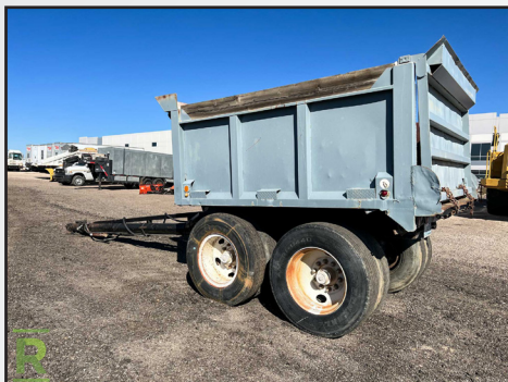
T/A DUMP PUP TRAILER