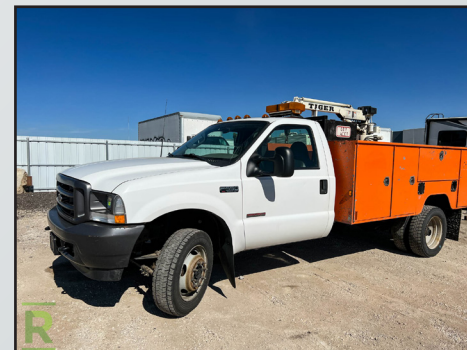
2003 FORD F550 SUPER DUTY 4WD SERVICE TRUCK W/ CRANE, COUNTY UNIT