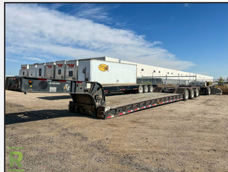
2006 SPECIALIZED TRI-AXLE 60-TON LOWBOY TRAILER W/ STINGER, COUNTY UNIT