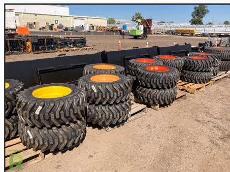
NEW SKID STEER TIRES