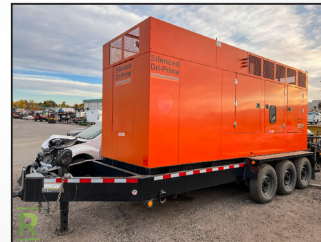
2008 GODWIN 12" TOWABLE PUMP W/ CATERPILLAR C15, 350 HOURS, CITY UNIT