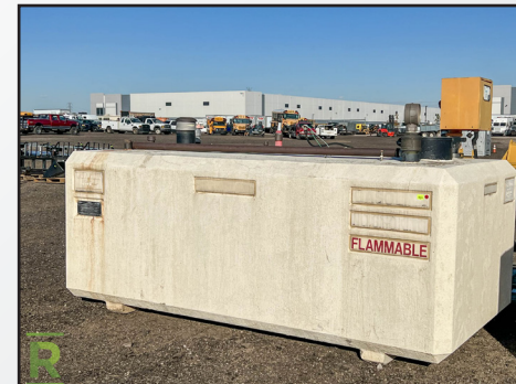
1000 GALLON CONVAULT, MUNICIPALITY UNIT