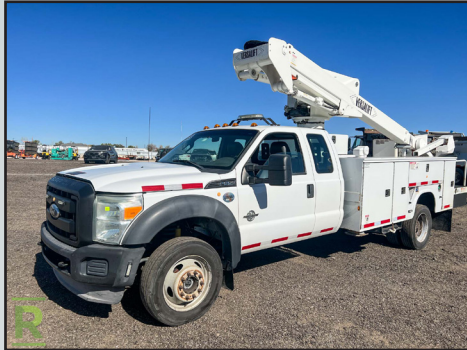
2011 FORD F550 SUPER DUTY 4X4 BUCKET TRUCK W/ VERSALIFT 40' BOOM