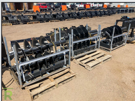
NEW SKID STEER POSTHOLE DIGGING ATTACHMENTS