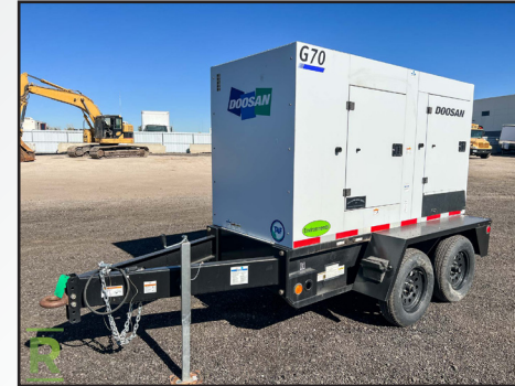
2019 DOOSAN 70KW TOWABLE GENERATOR