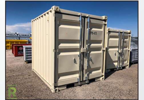
NEW 8' & 9' STEEL STORAGE CONTAINERS

New 72" Hydraulic Rototiller Attachments To Fit Skid Steer Loader