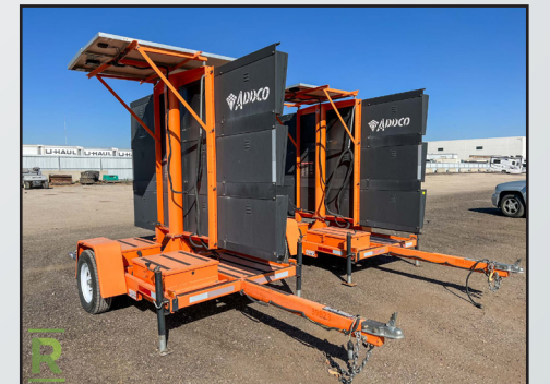
ADDCO TOWABLE MESSAGE BOARDS, COUNTY UNITS