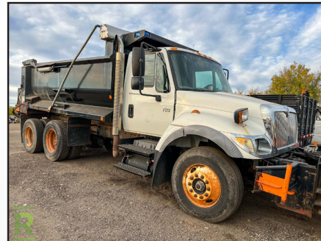
2007 INTERNATIONAL 7400 T/A DUMP TRUCK, CITY UNIT