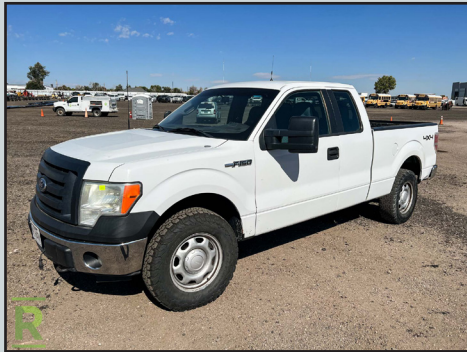
2012 FORD F150 4X4 PICKUP