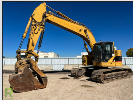
2004 CATERPILLAR 321CLCR HYDRAULIC EXCAVATOR

(4) Bomag BW55E Walk-Behind Asphalt Rollers, Honda Gas Engine, 22" Drum, County Units