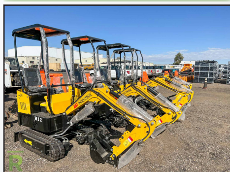
NEW 2022 AGROTK H12 MINI EXCAVATORS