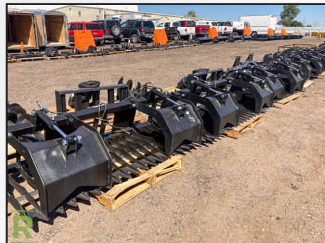
NEW SKID STEER GRAPPLE BUCKETS