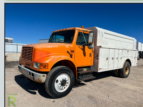
INTERNATIONAL 4900 S/A HIGH TOP UTILITY TRUCK W/ DT466, COUNTY UNIT