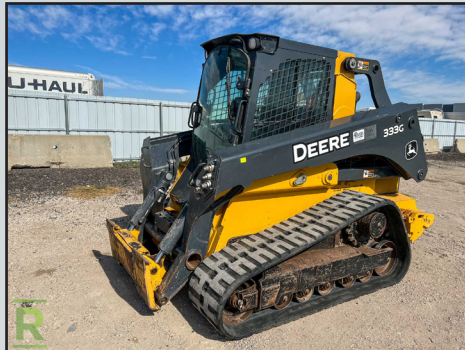
2018 JOHN DEERE 333G CRAWLER SKID STEER LOADER W/ 2400 HOURS