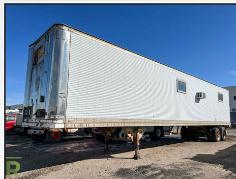
TRAILMOBILE T/A VAN TRAILER, 48' X 102", SETUP FOR OFFICES