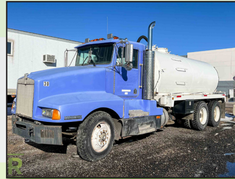
KENWORTH T600 T/A VACUUM TRUCK