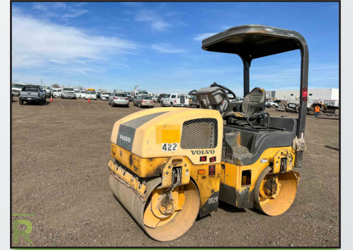
2014 VOLVO DD29 RIDE-ON VIBRATORY SMOOTH DRUM ROLLER