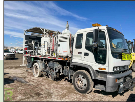
2000 GMC T6500 PAINT STRIPING TRUCK, CITY UNIT