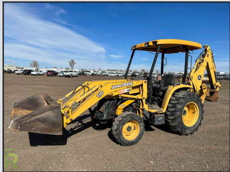
JOHN DEERE 110 4WD LOADER/ BACKHOE