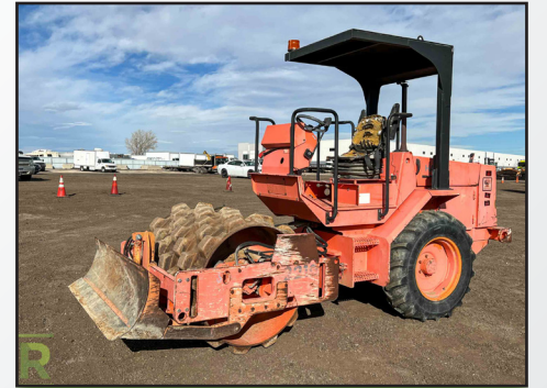
HAMM 2210SSD RIDE-ON SHEEPSFOOT ROLLER

2007 Hyster H155FT Forklift, 15,500 lbs. Capacity, 212" Lift Height, Side Shift, Fork Positioning, 96" Forks, Enclosed Cab With Heat & AC, Dual Front Tires, Hour Meter Reads: 7264, S/N: H006V02170E