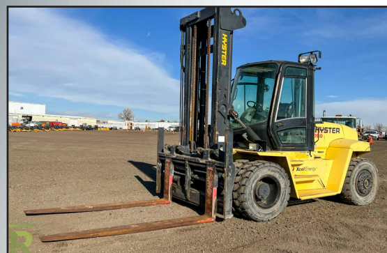
2005 HYSTER H190HD DIESEL FORKLIFT, 19,000 LB. CAPACITY

Inspection: March 13th & 14th from 8:15 a.m. to 4:45 p.m.