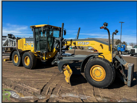
2010 JOHN DEERE 772GP 6WD MOTOR GRADER, COUNTY UNIT