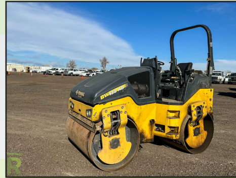
2016 BOMAG BW138AD-5 RIDE-ON VIBRATORY SMOOTH DRUM ROLLER