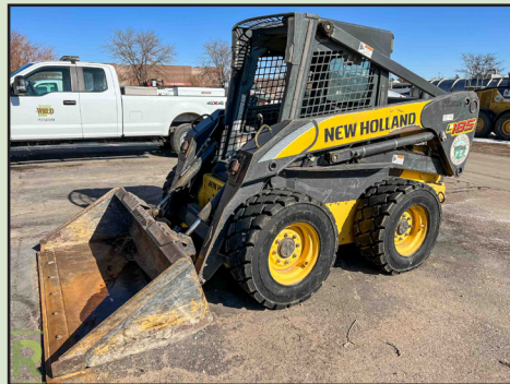
2008 NEW HOLLAND L185 SKID STEER LOADER W/ 1926 HOURS, COUNTY UNIT