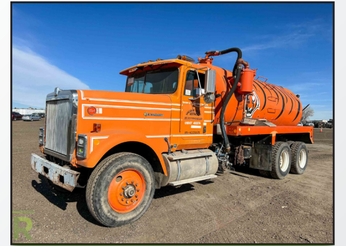
1992 INTERNATIONAL EAGLE 9300 T/A VACUUM TRUCK

2000 International 4700 S/A Flatbed Truck, 7.3L V8 T444E, 5-Speed, Spring Suspension, 12' Bed