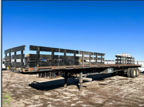
1995 UTILITY T/A 48' FLATBED TRAILER