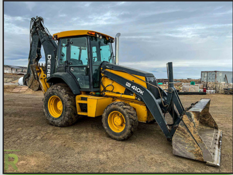
2013 JOHN DEERE 410K 4WD LOADER/ BACKHOE, EXTENDAHOE