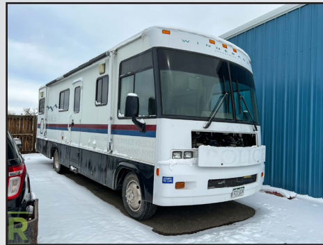
1999 WINNEBAGO BRAVE COMMAND CENTER VEHICLE, GAS ENGINE, CITY UNIT