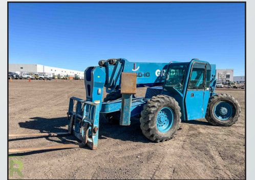
GRADALL 544D-10 TELESCOPIC FORKLIFT, 10,000 LB. CAPACITY