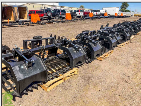
VIEW OF NEW GRAPPLE BUCKETS FOR SKID STEER LOADERS