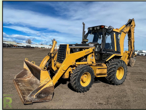
1998 CATERPILLAR 446B 4WD LOADER/ BACKHOE, CITY UNIT

2018 Leeboy 8500D Asphalt Paver, Kubota Diesel, Legend Electric Screed System, 8'-15', Hour Meter Reads: 1468, S/N: 174847