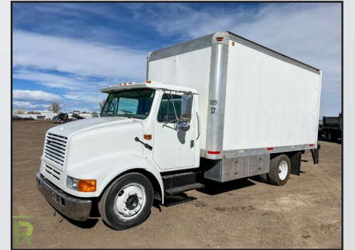
2001 INTERNATIONAL 4700 16' VAN BODY TRUCK, DIESEL