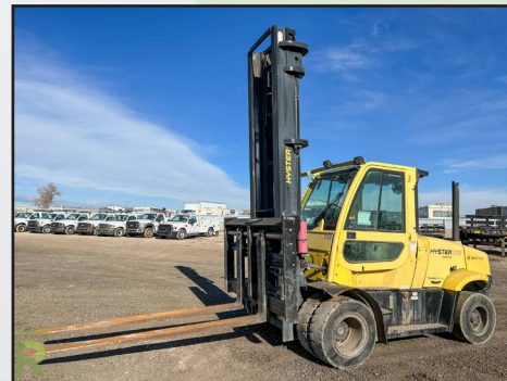
HYSTER H175FT DIESEL FORKLIFT, 17,500 LB. CAPACITY