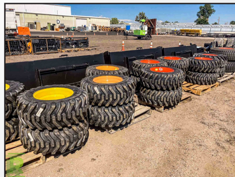
VIEW OF NEW SKID STEER TIRES