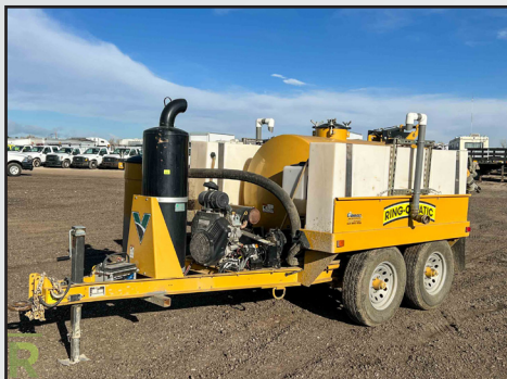
2010 VERMEER RING-O-MATIC VACUUM TRAILER, 369 HOURS, MUNICIPALITY UNIT