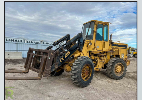
CATERPILLAR IT28 INTEGRATED TOOL CARRIER