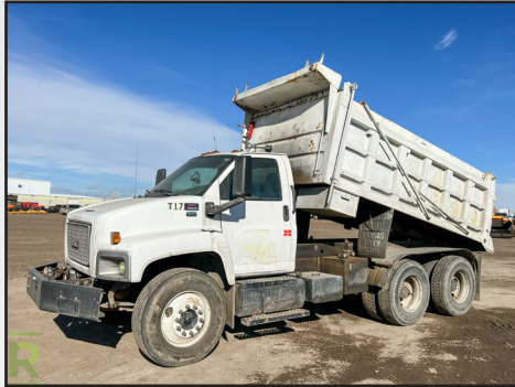
2006 GMC C8500 T/A DUMP TRUCK W/ DURAMAX DIESEL