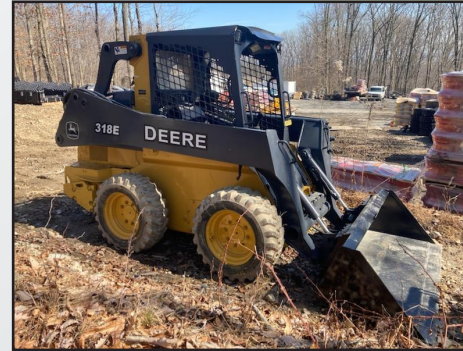
JOHN DEERE 318E SKID STEER LOADER