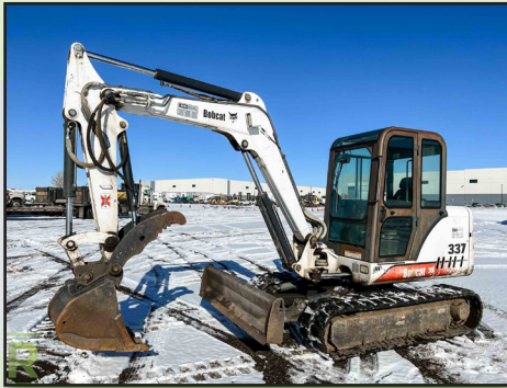
2003 BOBCAT 337 MINI EXCAVATOR

2000 Ford F350 Super Duty XL 4x4 Landscaping Dump Truck, Power Stroke 7.3L V8, Automatic, 9' Dump Bed, Dually