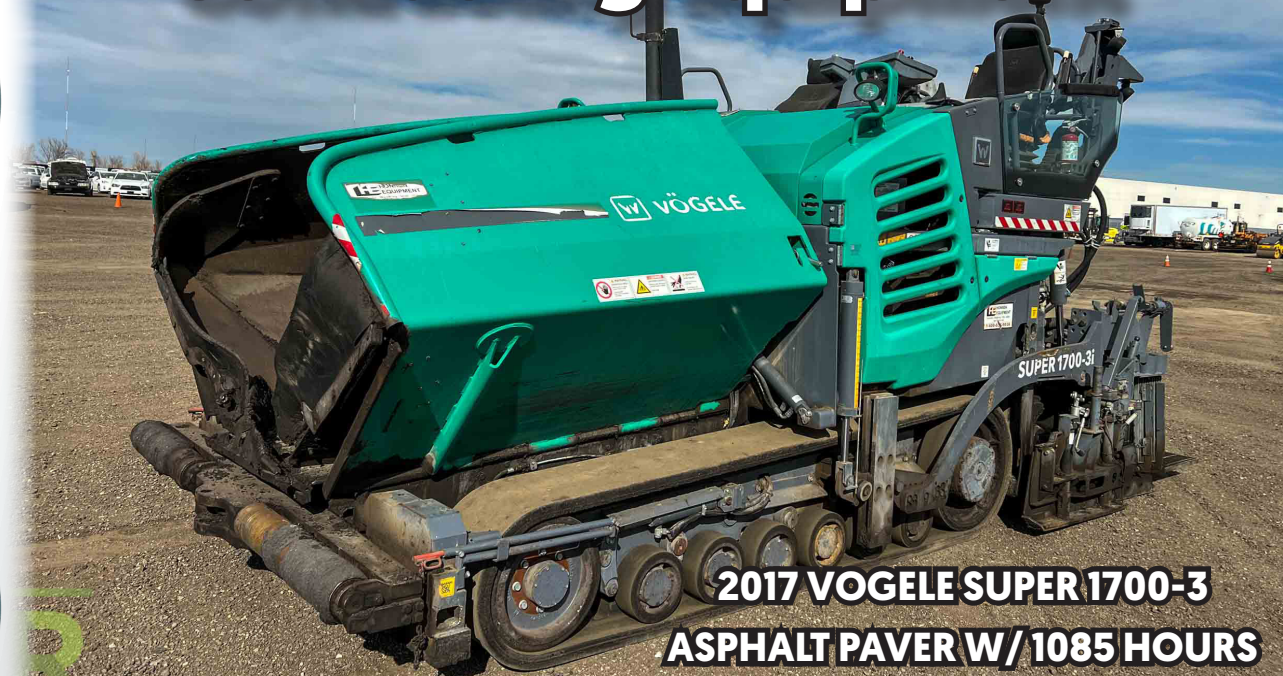
2017 VOGELE SUPER 1700-3 ASPHALT PAVER W/ 1085 HOURS

7500 York Street • Denver, Colorado 80229 WEDNESDAY • March 15th • 9:00 A.M.