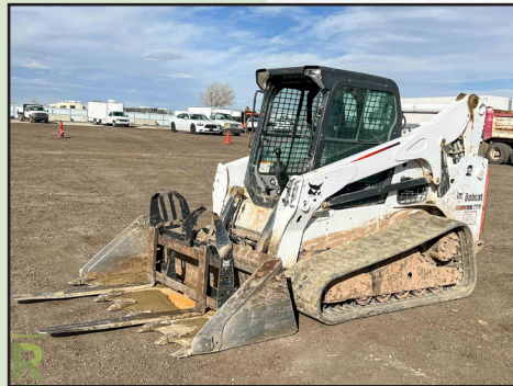
2014 BOBCAT T770 CRAWLER SKID STEER LOADER, 2-SPEED