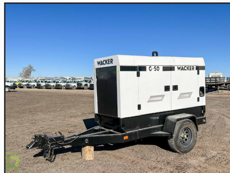
WACKER 50 KVA TOWABLE DIESEL GENERATOR