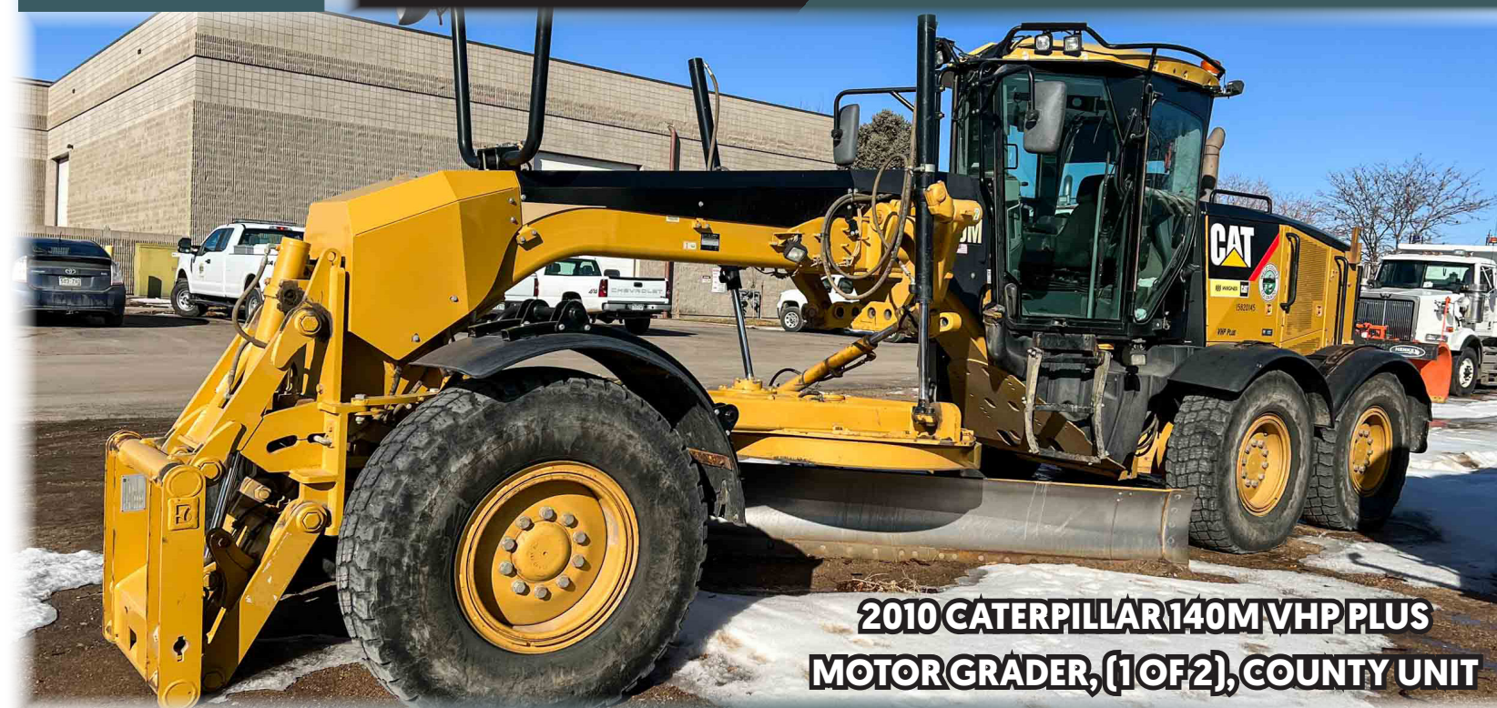
2010 CATERPILLAR 140M VHP PLUS MOTOR GRADER, (1 OF 2), COUNTY UNIT

Internet Only Auction • Bidding Available at: www.RollerAuction.com/construction