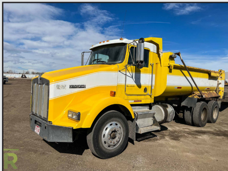
1997 KENWORTH T800 T/A DUMP TRUCK W/ CUMMINS