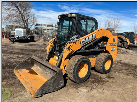
2015 CASE SV300 SKID STEER LOADER