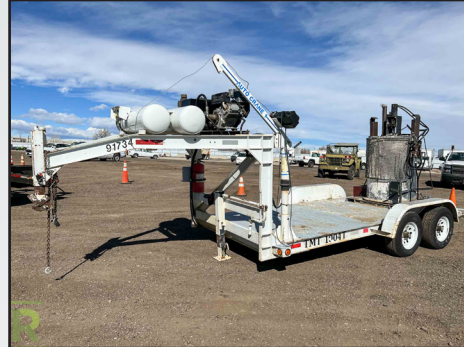
1999 ZIEMAN T/A GOOSENECK EQUIPMENT TRAILER, CITY UNIT