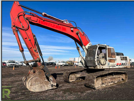
LINKBELT 330LX HYDRAULIC EXCAVATOR W/ HYDRAULIC THUMB