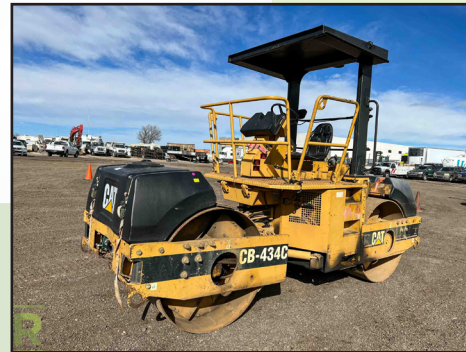
2000 CATERPILLAR CB434C RIDE-ON VIBRATORY SMOOTH DRUM ROLLER