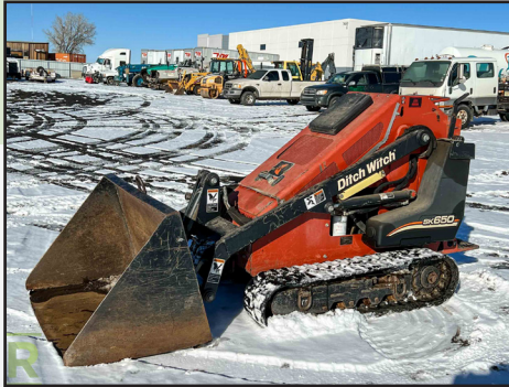
2011 DITCH WITCH SK650 MINI SKID STEER LOADER, KUBOTA DIESEL