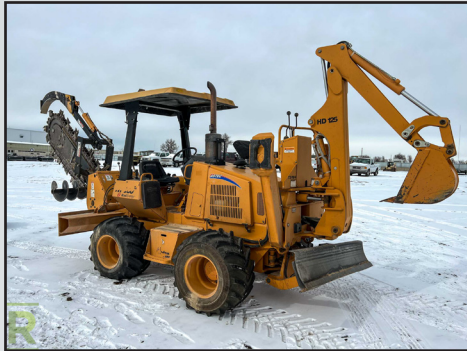
ASTEC RT660II RIDE ON TRENCHER W/ BACKHOE, 579 HOURS