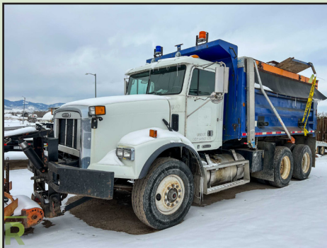
2000 FREIGHTLINER T/A DUMP TRUCK W/ CUMMINS ISM, CITY UNIT