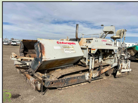
1995 CEDAR RAPIDS CR461 ASPHALT PAVER, CUMMINS DIESEL