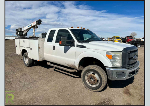
2014 FORD F350 4X4 UTILITY TRUCK W/ AUTO CRANE