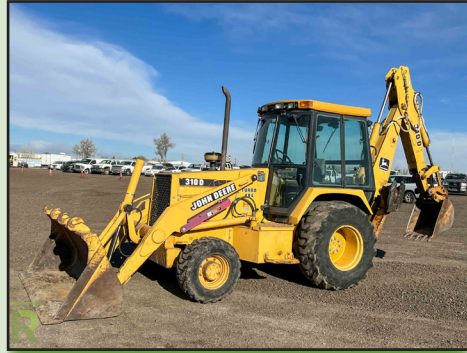
JOHN DEERE 310D 4WD LOADER/ BACKHOE, EXTENDAHOE, MUNICIPALITY UNIT