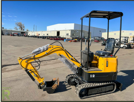
2023 LAND HERO 12 MINI EXCAVATOR, 0 HOURS