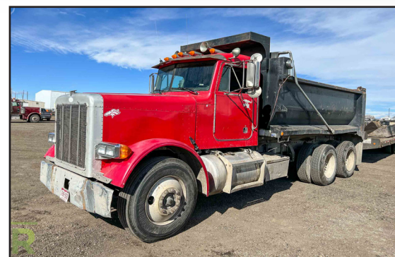
1995 PETERBILT 379 T/A DUMP TRUCK W/ CUMMINS