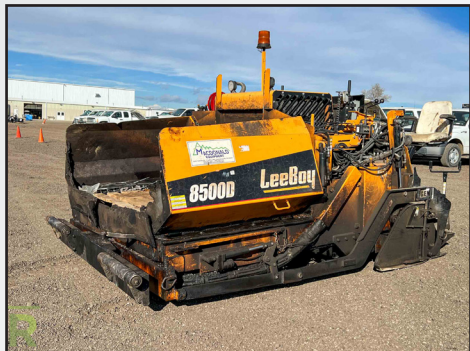
2018 LEEBOY 8500D ASPHALT PAVER W/ 1468 HOURS