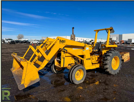
MASSEY FERGUSON 40B TRACTOR/ LOADER