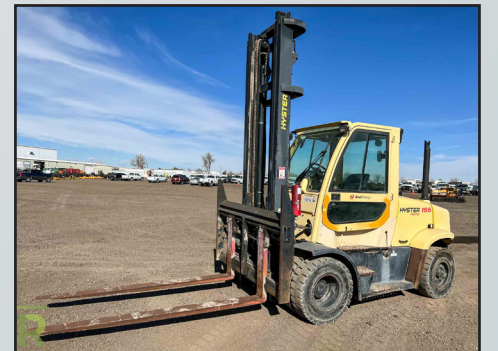
2007 HYSTER H155FT DIESEL FORKLIFT, 15,500 LB. CAPACITY