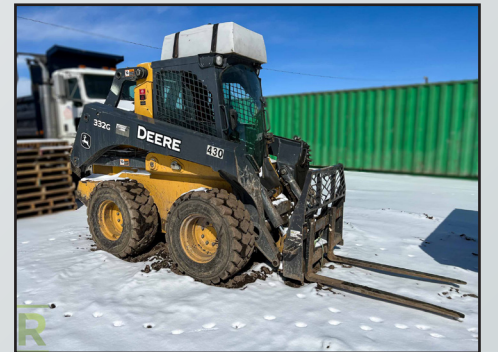
2017 JOHN DEERE 332G SKID STEER LOADER W/ 2189 HOURS