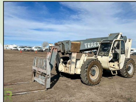
TEREX TH1056C TELESCOPIC FORKLIFT, 10,000 LB. CAPACITY