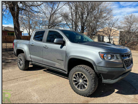
2020 CHEVROLET COLORADO ZR2 4X4 CREW CAB PICKUP