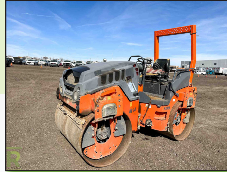
2015 HAMM HD14VV RIDE-ON VIBRATORY SMOOTH DRUM ROLLER