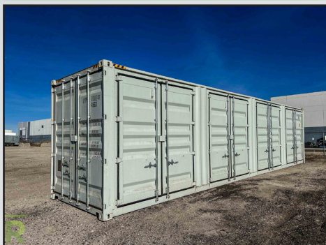
NEW 40' STEEL STORAGE CONTAINER, HIGH CUBE