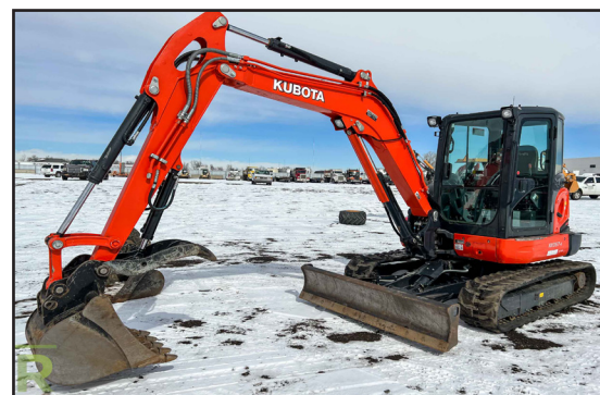
2019 KUBOTA KX057-4 HYDRAULIC EXCAVATOR W/ 1328 HOURS