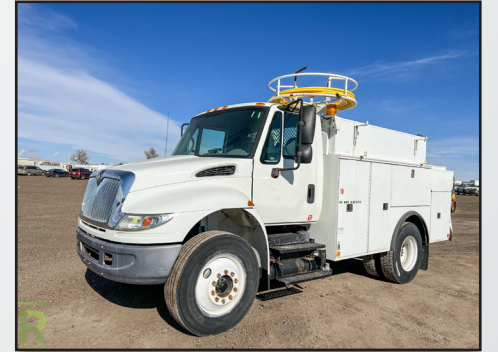
2006 INTERNATIONAL 4400 S/A COMPRESSOR TRUCK W/ DT466