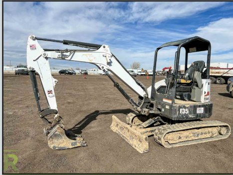
2013 BOBCAT E35 MINI EXCAVATOR W/ 3871 HOURS