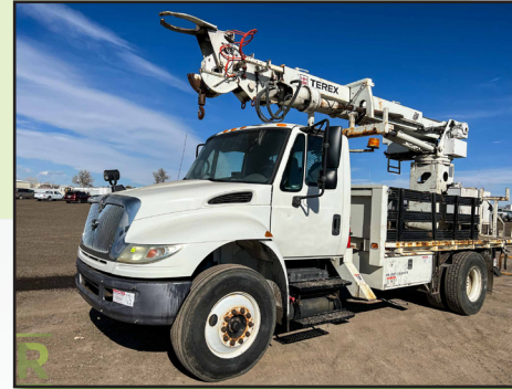
2005 INTERNATIONAL 4400 S/A DIGGER DERRICK TRUCK W/ TEREX BOOM