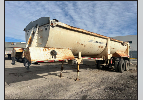
1997 TRAIL KING 32 FT. ROCK TRAILER