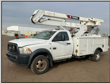
2012 RAM 5500 HD 4WD BUCKET TRUCK W/ TEREX 35 FT. BOOM