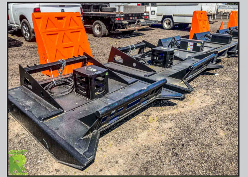
VIEW OF MOWER DECKS TO FIT SKID STEER LOADER