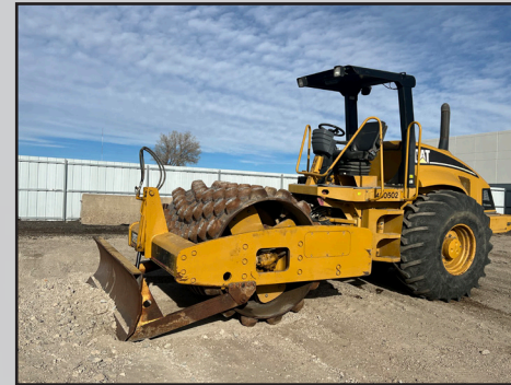
2005 CATERPILLAR CP563E RIDE-ON SHEEPSFOOT COMPACTOR