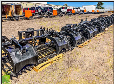
NEW GRAPPLE BUCKETS TO FIT SKID STEER LOADER