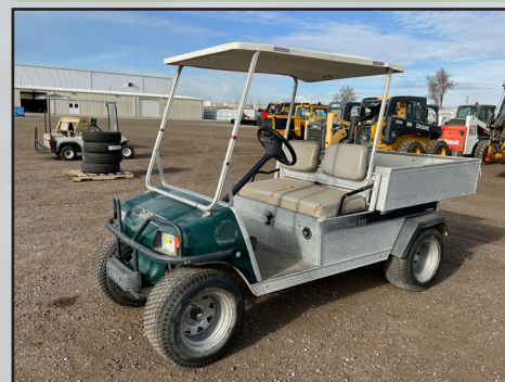
CLUB CAR CARRYALL 252 UTILITY CART