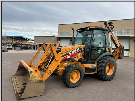
2011 CASE 580 SUPER N WT 4WD LOADER/ BACKHOE, EXTENDAHOE, CITY UNIT