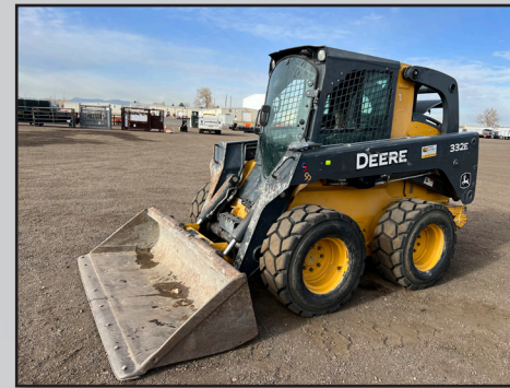
2015 JOHN DEERE 332E SKID STEER LOADER