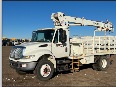
2006 INTERNATIONAL 4400 DIGGER DERRICK TRUCK W/ TEREX BOOM