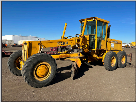
JOHN DEERE 772BH 6WD MOTOR GRADER W/ RIPPER