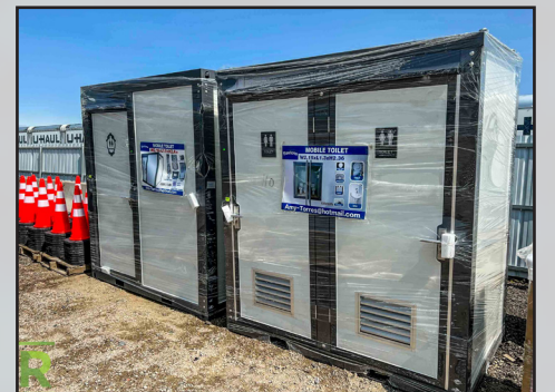
NEW BASTONE PORTABLE TOILETS