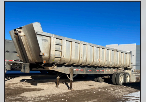
HOBBS 33 FT. ALUMINUM END DUMP TRAILER, FRAME TYPE