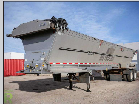
2012 TRAIL KING OLB-236 LIVE BOTTOM TRAILER, (1 OF 2), MUNICIPALITY UNIT