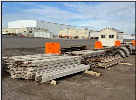
CONCRETE CURB AND GUTTER FORMS