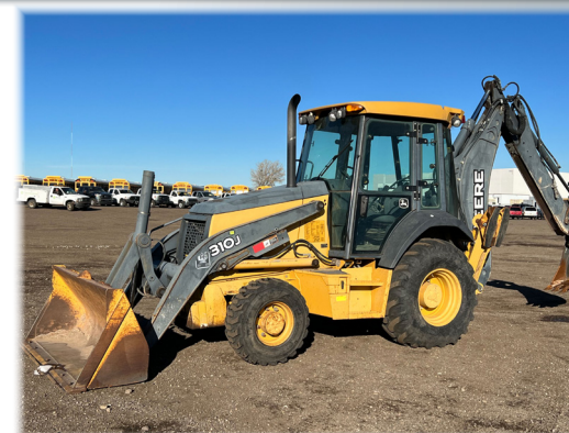
2003 JOHN DEERE 310J 4WD LOADER/BACKHOE, EXTENDAHOE

Internet Only Auction • Bidding Available at: www.RollerAuction.com/construction