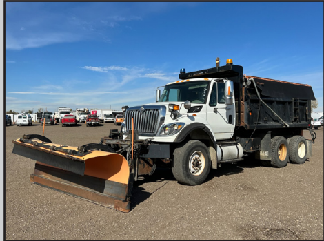
2009 INTERNATIONAL WORKSTAR 7600 DUMP TRUCK W/ PLOW, CITY UNIT