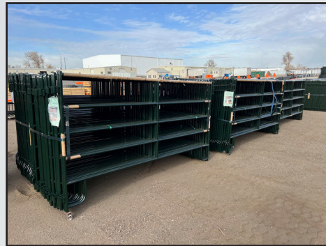
PARTIAL VIEW OF NEW LIVESTOCK PANELS

(4) Sets of (4) New Forerunner 10-16.5 Skid Steer Tires with Wheels