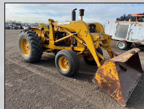
JOHN DEERE 500 TRACTOR/ LOADER