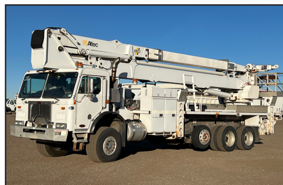
2011 PETERBILT PB320 BUCKET TRUCK W/ ALTEC AH125 BOOM, 39K MILES