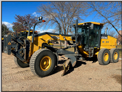
2012 JOHN DEERE 770G MOTOR GRADER, [1 OF 2], COUNTY UNIT