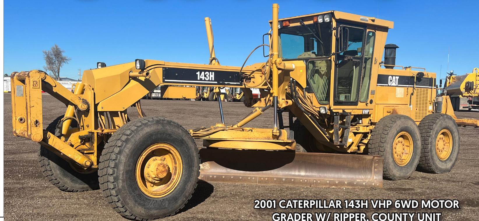
2001 CATERPILLAR 143H VHP 6WD MOTOR GRADER W/ RIPPER, COUNTY UNIT