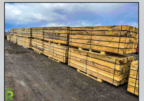
NEW WOOD TIMBERS