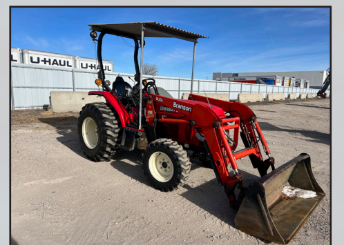
BRANSON 3510i 4WD TRACTOR/ LOADER