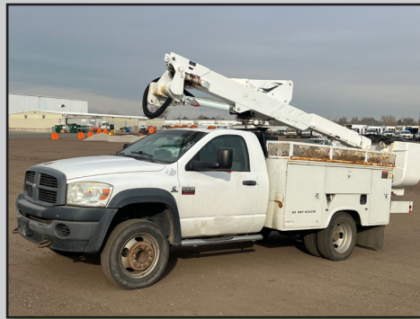
2010 DODGE RAM 5500 HD BUCKET TRUCK W/ TEREX 35 FT. BOOM

(2) 2007 Ford F450 Super Duty XL RWD Utility Trucks,