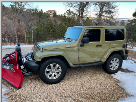
2013 JEEP WRANGLER SAHARA, 4WD, W/ BOSS V-PLOW