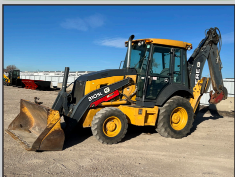
2016 JOHN DEERE 310SL 4WD LOADER/ BACKHOE, EXTENDAHOE