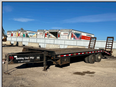
ROCKING CHAIR T/A 20' EQUIPMENT TRAILER