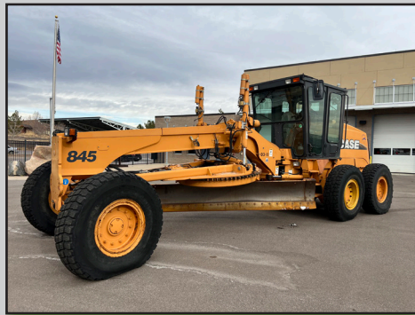
2003 CASE 845 MOTOR GRADER, CITY UNIT

New 2023 Roda RD380L Mini Skid Steer, 13.5 HP, 6" Rubber Tracks, 38" Bucket, Front Auxiliary Hydraulics,