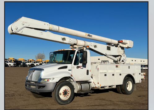
2012 INTERNATIONAL 4300 BUCKET TRUCK W/ ALTEC 55 FT. BOOM