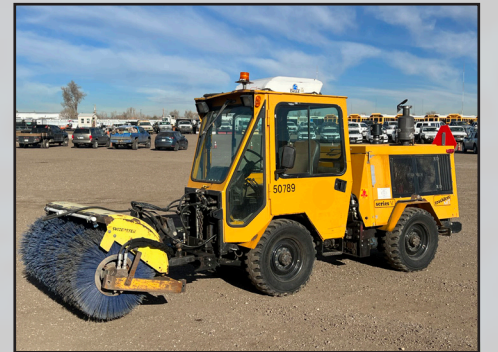
TRACKLESS MT5T ARTICULATING 4WD TRACTOR W/ 2897 HOURS, CITY UNIT