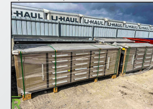
NEW STAINLESS STEEL TOOLBOXES

(4) New Magnum 4000 Hot Water Pressure Washers, Gas, Diesel Heater, Hose & Wand