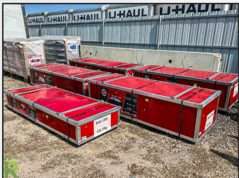
NEW STORAGE SHELTERS