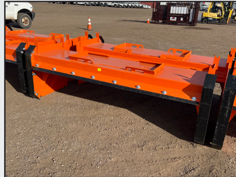
NEW SNOW PUSHER ATTACHMENT TO FIT SKID STEER LOADER, [1 OF 15]