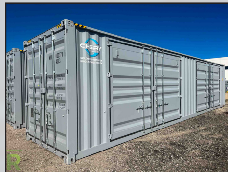
NEW 2023 40' STEEL STORAGE CONTAINER, HIGH CUBE