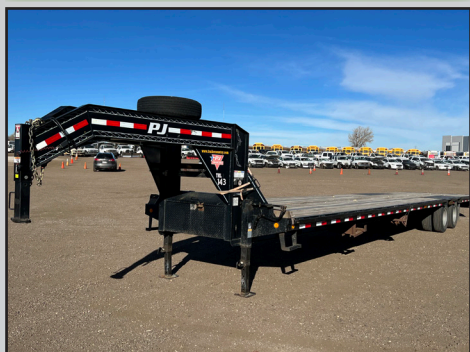
2020 PJ 40' GOOSENECK EQUIPMENT TRAILER