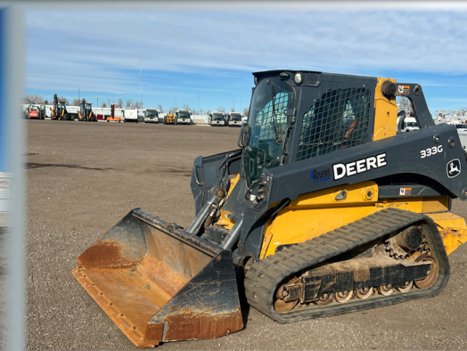
2017 JOHN DEERE 333G CRAWLER SKID STEER LOADER W/ 3221 HOURS