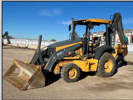
2011 JOHN DEERE 310J 4WD LOADER/ BACKHOE