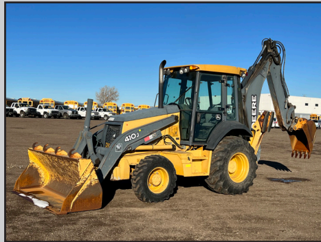
2008 JOHN DEERE 410J 4WD LOADER/ BACKHOE, EXTENDAHOE