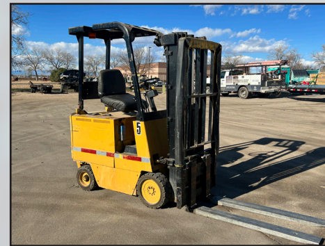
CATERPILLAR MC30 ELECTRIC FORKLIFT W/ CHARGER, COUNTY UNIT