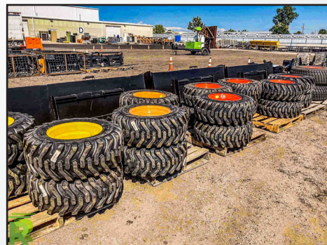
NEW SKID STEER TIRES