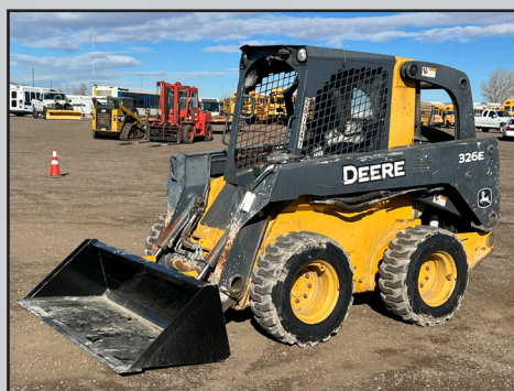
2015 JOHN DEERE 326E SKID STEER LOADER