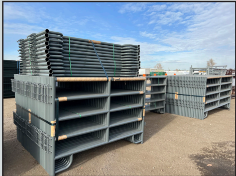
PARTIAL VIEW OF NEW LIVESTOCK PANELS