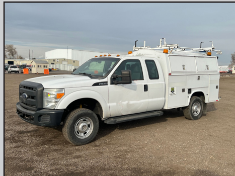
2012 FORD F350XL SUPER DUTY 4WD UTILITY TRUCK