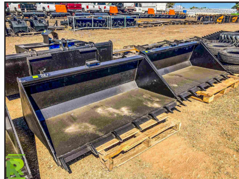
NEW SKID STEER BUCKETS