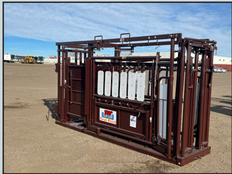
NEW TOUGH RANCH CATTLE SQUEEZE CHUTE