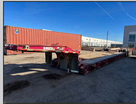
LOAD KING TRI-AXLE 50-TON LOWBOY TRAILER