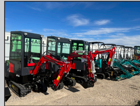
VIEW OF NEW 2023 LANTY MINI EXCAVATORS