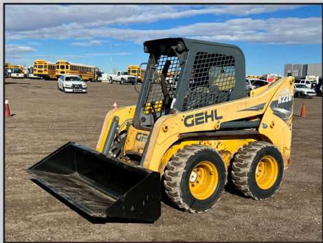
GEHL R220 SKID STEER LOADER