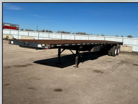
FRUEHAUF 45' X 96' FLATBED TRAILER