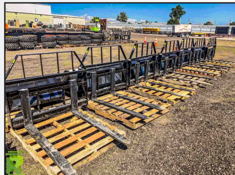
NEW FORK ATTACHMENTS TO FIT SKID STEER LOADER