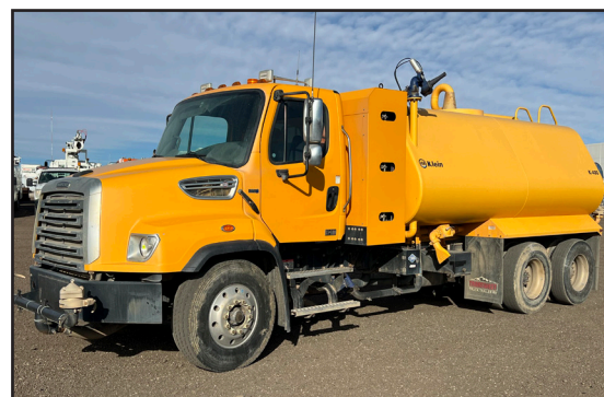
2018 FREIGHTLINER 114SD T/A WATER TRUCK W/ 69K MILES, COUNTY UNIT