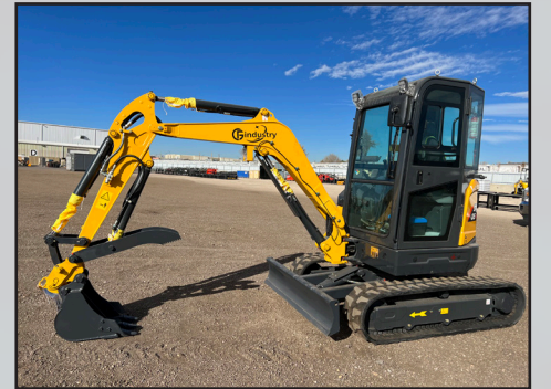
NEW 2023 CE STE35SR MINI EXCAVATOR W/ ENCLOSED CAB, [1 OF 2]