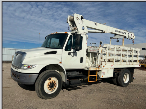
2005 INTERNATIONAL 4400 CRANE TRUCK W/ TEREX BOOM