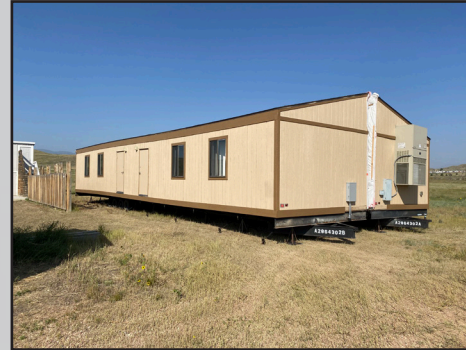
28 FT. X 64 FT. DOUBLE WIDE MODULAR TRAILER, COUNTY UNIT