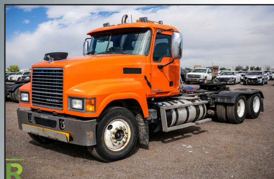
2013 MACK CHU613 TRUCK TRACTOR, COUNTY UNIT

Inspection: January 15th & 16th from 8:15 a.m. to 4:45 p.m.