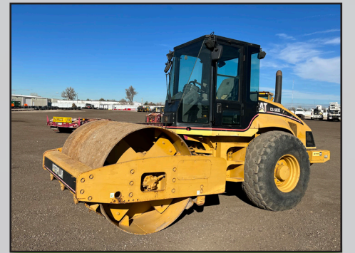
2006 CATERPILLAR CS563E SMOOTH DRUM ROLLER, COUNTY UNIT

2012 International 4300 S/A Bucket Truck, 7.6L, Automatic, Altec AA755MH Boom, 700 Lb. Max Capacity, 55' Max Height, Front & Rear Stabilizers