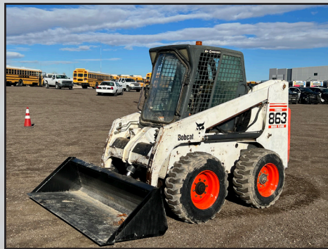
BOBCAT 863 SKID STEER LOADER