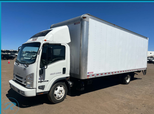
2017 ISUZU NPR S/A VAN BODY TRUCK