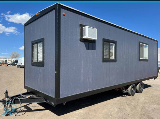
T/A OFFICE TRAILER, 8' X 28', W/ ELECTRICAL