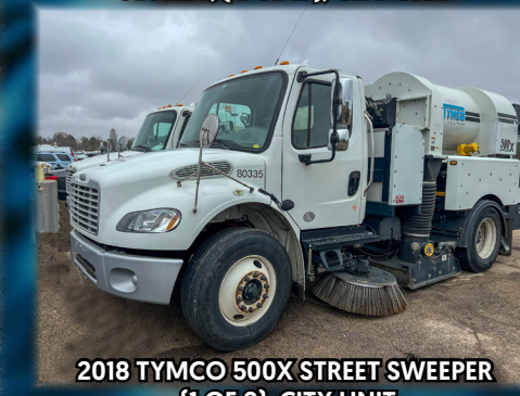
2018 TYMCO 500X STREET SWEEPER (1 OF 2), CITY UNIT

Roller & Associates, Inc. 7500 York Street • Denver, Colorado 80229 • [303] 289-1600 • www.rollerauction.com/construction