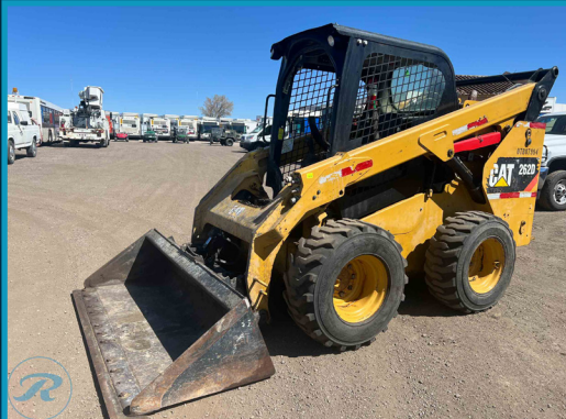
2018 CATERPILLAR 262D SKID STEER LOADER