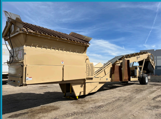
2005 ASTEC FT271K PORTABLE SCREENING PLANT