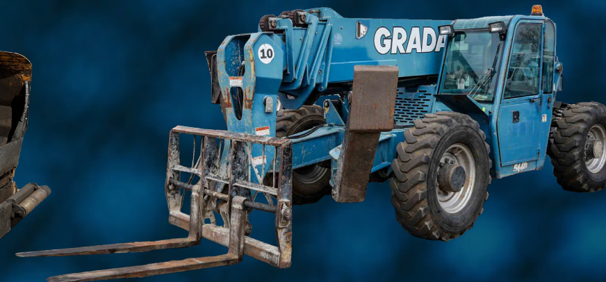
2006 GRADALL 544D-10 4WD TELESCOPIC FORKLIFT, 10,000 LB. CAPACITY