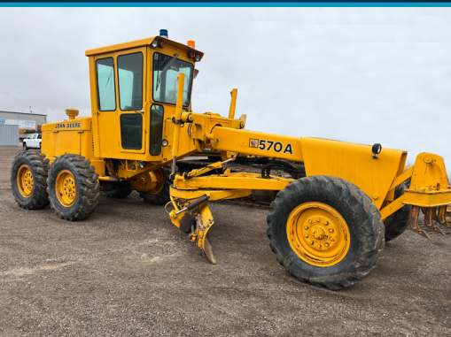
JOHN DEERE 570A MOTOR GRADER W/ FRONT SCARIFIER