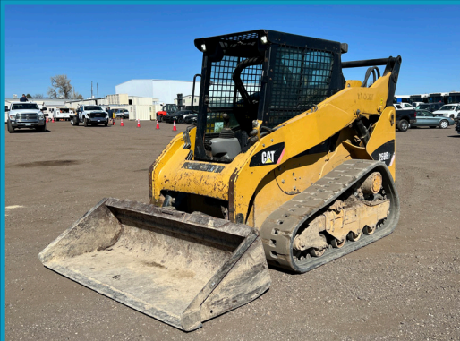
2011 CATERPILLAR 259B CRAWLER SKID STEER LOADER W/ 2600 HOURS