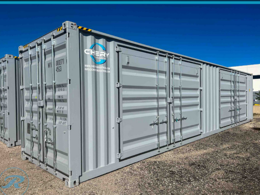
NEW 2024 40' STEEL STORAGE CONTAINER, HIGH CUBE, [1 OF 12]