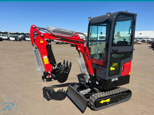
NEW 2024 LANTY LAT-135 MINI EXCAVATOR [1 OF 10]