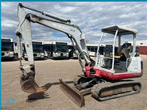
TAKEUCHI TB135 MINI EXCAVATOR