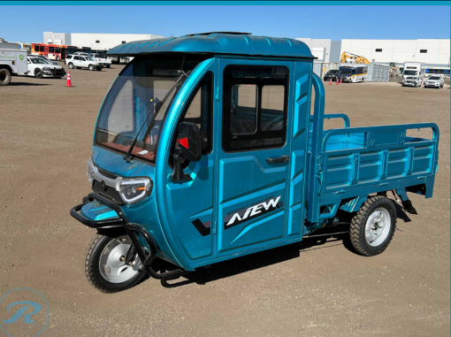
NEW 2024 MECO MC-16 ELECTRIC 3-WHEEL TRUCKSTER