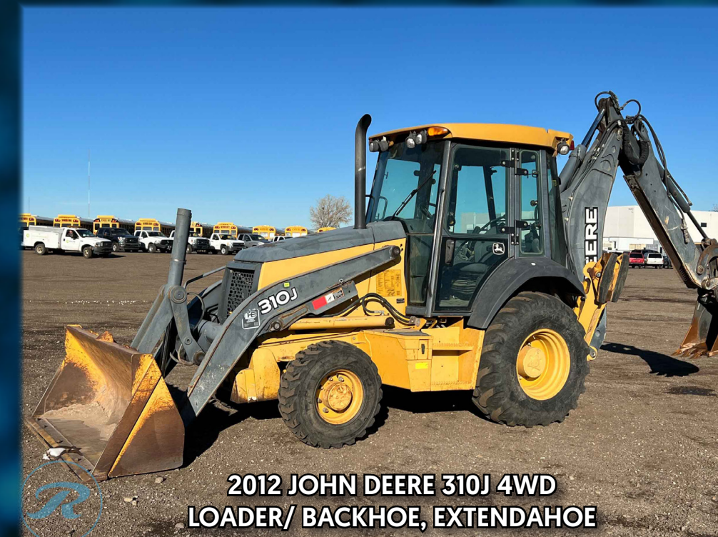
2012 JOHN DEERE 310J 4WD LOADER/ BACKHOE, EXTENDAHOE