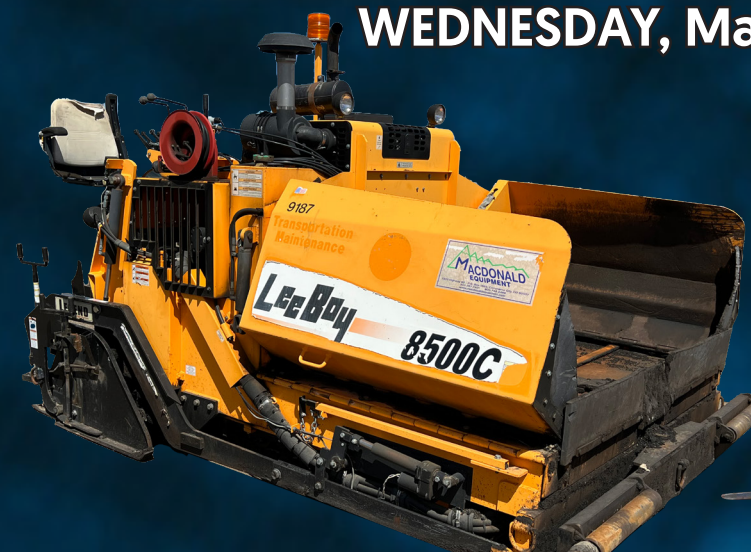
2013 LEEBOY 8500C CRAWLER ASPHALT PAVER W/ 750 HOURS, CITY UNIT