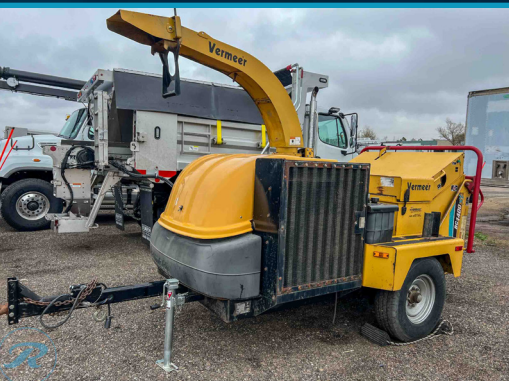
2006 VERMEER BC-1400 WOOD CHIPPER, CITY UNIT