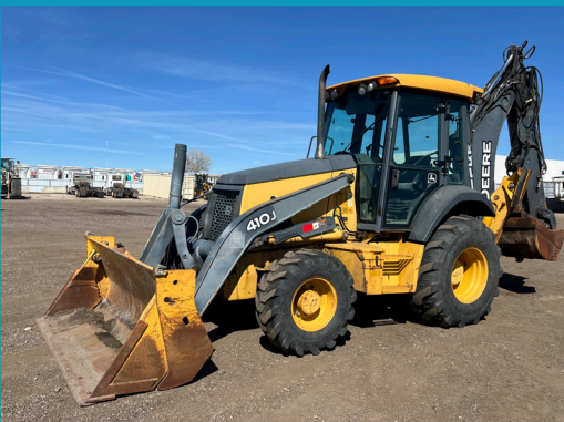
2011 JOHN DEERE 410J 4WD LOADER/ BACKHOE, EXTENDAHOE, CITY UNIT