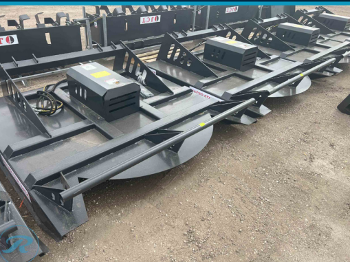
VIEW OF NEW BRUSH MOWERS TO FIT SKID STEER LOADER