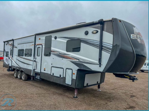
2015 CROSSROADS ELEVATION 38BY 5TH WHEEL TOY HAULER CAMPER TRAILER