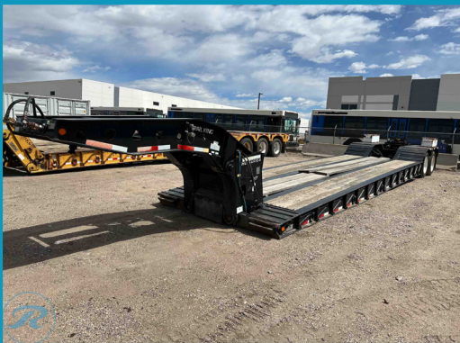
2002 TRAIL KING 35-TON LOWBOY TRAILER, CITY UNIT