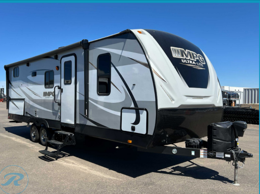
2020 CRUISER 2500BH T/A CAMPER TRAILER, BUMPER PULL