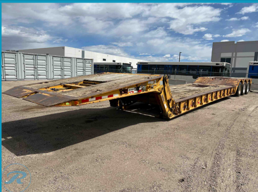
2004 LOAD KING TRI-AXLE 55-TON LOWBOY TRAILER, CITY UNIT