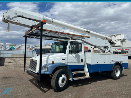
FREIGHTLINER FL70 S/A BUCKET TRUCK W/ ALTEC 55 FT. BOOM