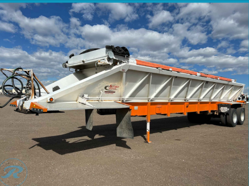
2001 RED RIVER T/A LIVE BOTTOM TRAILER, [1 OF 2]