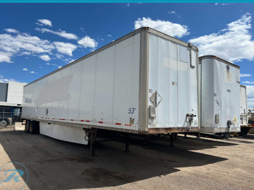
PARTIAL VIEW OF STORAGE VAN TRAILERS