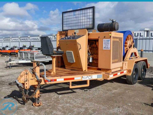
2009 WAGNER-SMITH T-DPT-90 CABLE PULLING TRAILER