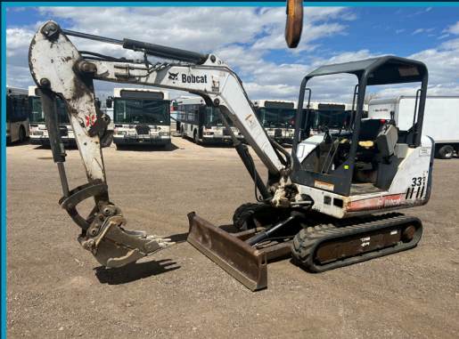
2006 BOBCAT 331G MINI EXCAVATOR, [1 OF 2]