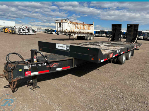
2000 LOAD KING T/A EQUIPMENT TRAILER, DUALS, CITY UNIT