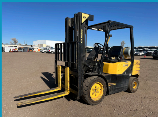
DAEWOO G30S-3 PROPANE FORKLIFT, 6000 LB. CAPACITY