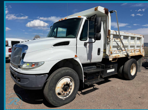
2005 INTERNATIONAL 4400 S/A DUMP TRUCK