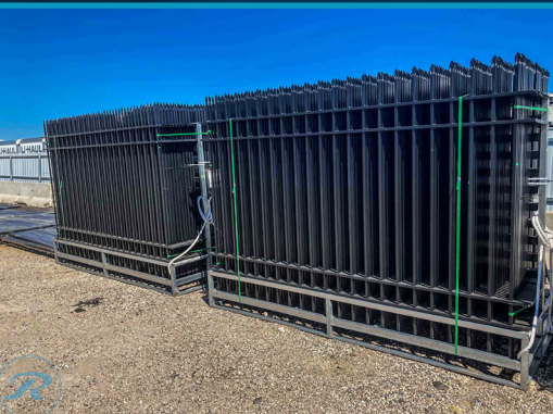
PARTIAL VIEW OF RESIDENTIAL FENCE PANELS