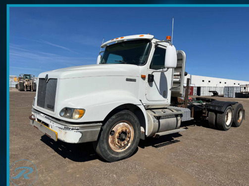
INTERNATIONAL 9400i TRUCK TRACTOR, MUNICIPALITY UNIT (1 OF 2)

PRESORTED FIRST CLASS MAIL U.S. POSTAGE PAID DENVER CO PERMIT # 4033