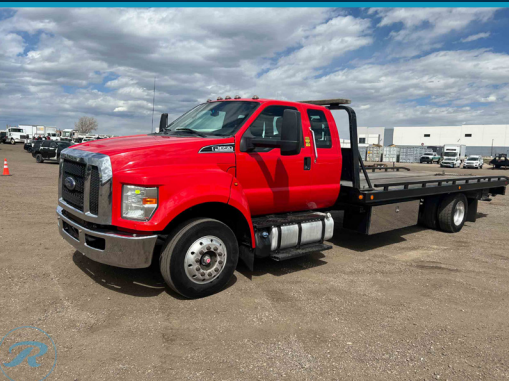
2017 FORD F650 SUPER DUTY ROLLBACK TRUCK W/ CENTURY 22' BED