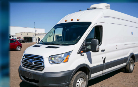
2016 FORD TRANSIT 350 4WD PIPELINE INSPECTION VAN W/ CUE CAMERA SYSTEM, (1 OF 2), CITY UNIT