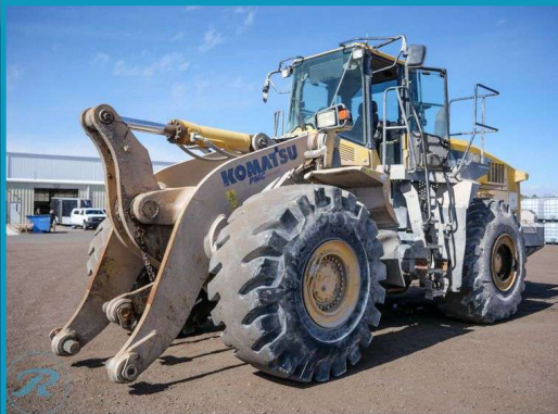
2013 KOMATSU WA500-7 WHEEL LOADER