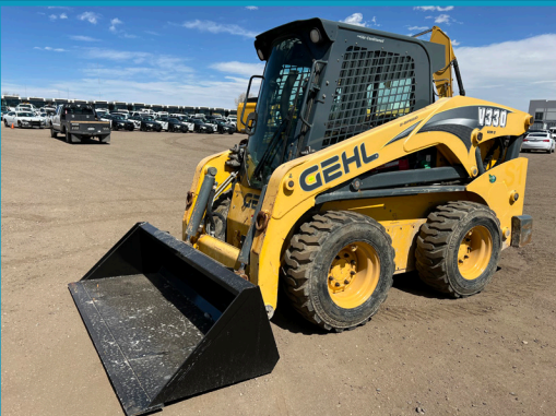
GEHL V330 SKID STEER LOADER W/ 1700 HOURS