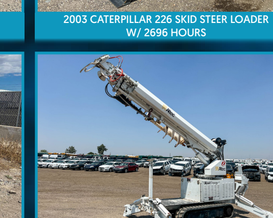
2014 ALTEC DB37 BACKYARD DIGGER DERRICK/ CRANE UNIT W/ 507 HOURS