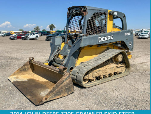
2014 JOHN DEERE 329E CRAWLER SKID STEER