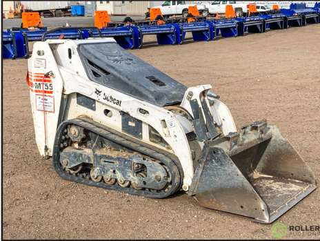
2012 BOBCAT MT55 MINI SKID STEER LOADER