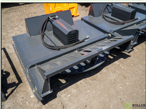
NEW HYDRAULIC BRUSH CUTTING ATTACHMENT FOR SKID STEER