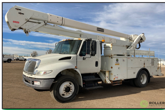
2006 INTERNATIONAL 4400 BUCKET TRUCK W/ TEREX 52 FT. BOOM

SELLING FOR Weld County Adams County Douglas County Local Banks Xcel Energy