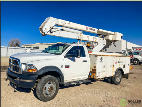
2011 DODGE 5500 4WD BUCKET TRUCK W/ TEREX 37 FT. BOOM