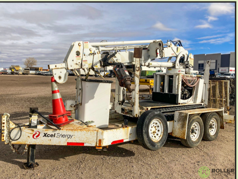
2007 S.D.P. EZ HAULER 3800 MINI CRANE W/ 424 HOURS