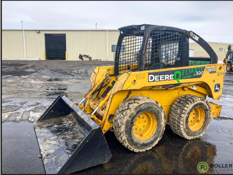
2006 JOHN DEERE 320 SKID STEER LOADER