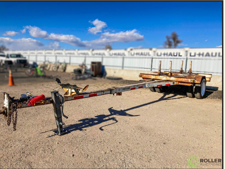
TAYLOR S/A POLE TRAILER