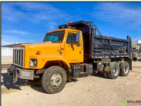
2000 INTERNATIONAL 2674 T/A DUMP TRUCK W/ CUMMINS 400 HP