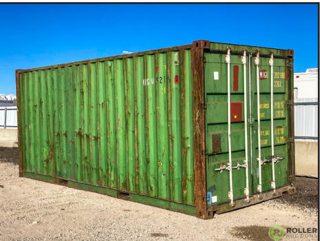
20' STEEL STORAGE CONTAINER