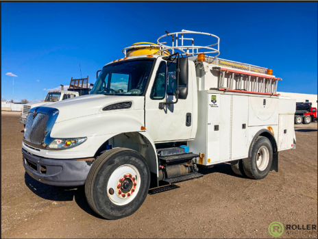
2006 INTERNATIONAL 4400 COMPRESSOR TRUCK W/ DT466