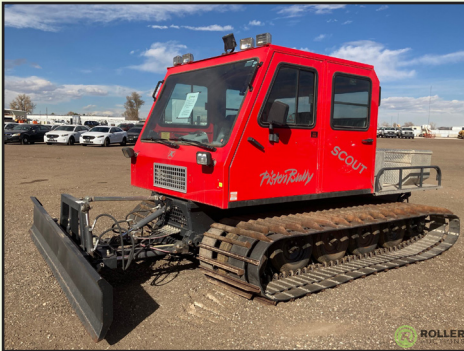
2009 PISTEN BULLY SCOUT SNOWCAT

Caterpillar V90F Gas Forklift, 10,000 lb. Capacity, 3-Stage Mast, Enclosed Cab, Pneumatic Tires, Dual Front Wheels, 48" Forks, Hour Meter Reads: 4148, S/N: 77X02293