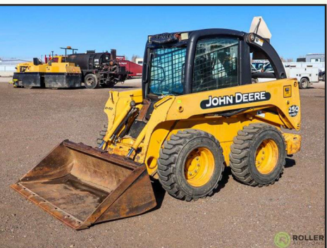
2004 JOHN DEERE 250 SKID STEER LOADER W/ 581 HOURS