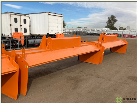
NEW SNOW PUSHERS