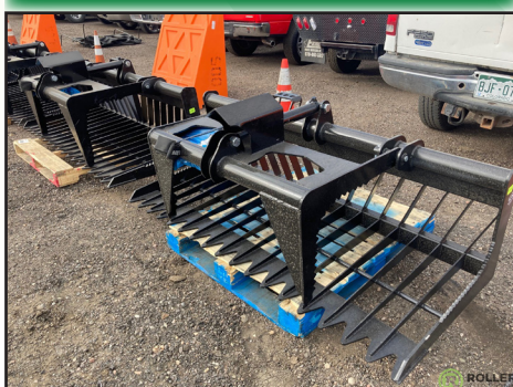
NEW HYDRAULIC GRAPPLE BUCKETS FOR SKID STEER