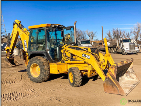
JOHN DEERE 310E 4WD LOADER/ BACKHOE