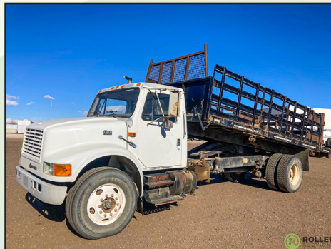
2000 INTERNATIONAL 4700 STAKEBODY DUMP TRUCK, COUNTY UNIT