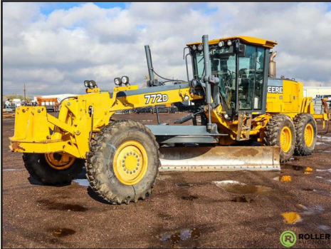
2008 JOHN DEERE 772D 6WD MOTOR GRADER W/ BRAND NEW ENGINE