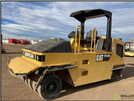
2008 CATERPILLAR PS150C 9-WHEEL PNEUMATIC ROLLER, COUNTY UNIT

2001 International 4800 S/A Digger Derrick Truck, DT466E, 6-Speed, Spring Suspension, Terex Boom, 12' Utility Box, 33,000 lb. GVWR, Pintle Hitch