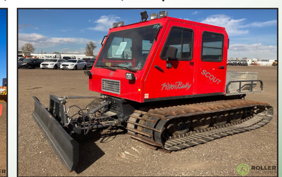
2009 PISTEN BULLY SCOUT SNOWCAT