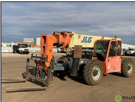
2007 JLG G10-55A 4WD TELESCOPIC FORKLIFT