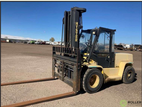
HYSTER 15,000 LB. DIESEL FORKLIFT W/ ENCLOSED CAB