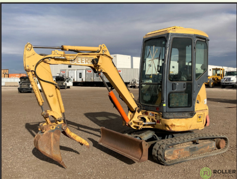
2005 JOHN DEERE 27C MINI EXCAVATOR W/ 1970 HOURS