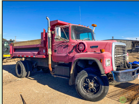
FORD L8000 S/A DUMP TRUCK, DIESEL