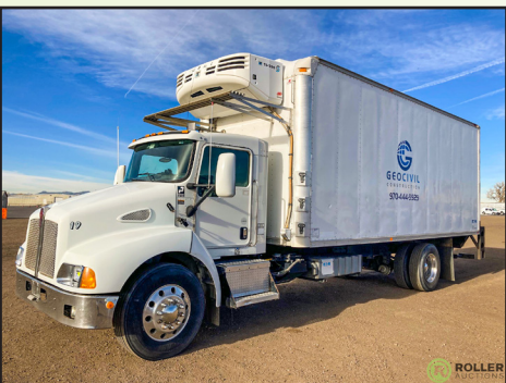
2008 KENWORTH T300 VAN BODY TRUCK W/ REEFER UNIT