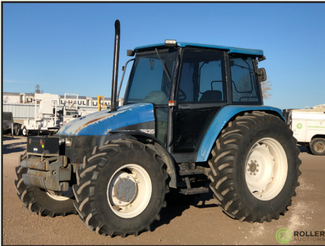
NEW HOLLAND 7635 4WD AGRICULTURAL TRACTOR, MUNICIPALITY UNIT