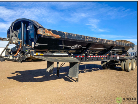
2014 JET T/A SIDE DUMP TRAILER W/AIR RIDE