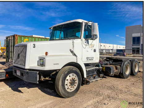
1999 VOLVO T/A TRUCK TRACTOR