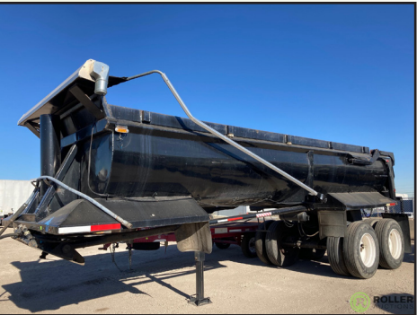
RELIANCE 24 FT. END DUMP TRAILER