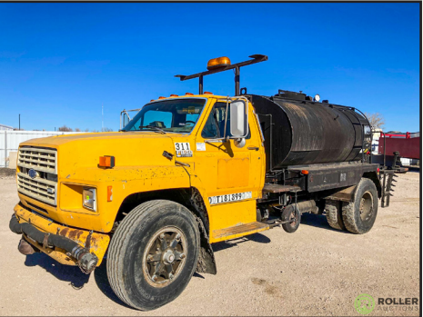
FORD F800 ASPHALT DISTRIBUTOR TRUCK W/ ROSCO BED