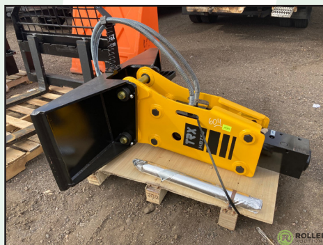
NEW HYDRAULIC BREAKER ATTACHMENT FOR SKID STEER