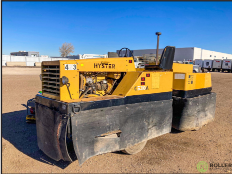
HYSTER C530A 9-WHEEL PNEUMATIC ROLLER