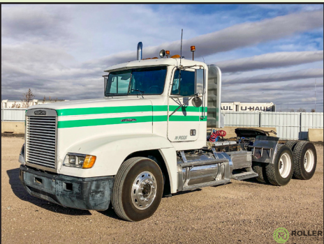
FREIGHTLINER T/A TRUCK TRACTOR W/ CUMMINS N14