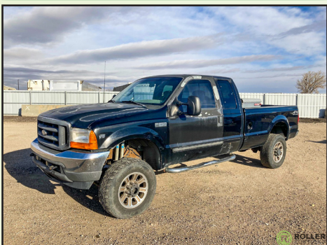
FORD F250XLT 4WD SUPER CAB PICKUP