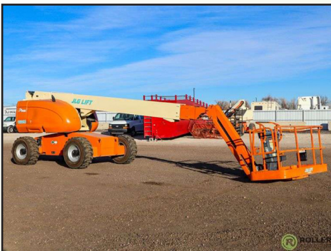
2007 JLG 660SJ 4WD BOOMLIFT, DIESEL