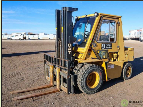
CATERPILLAR 10,000 LB. GAS FORKLIFT W/ ENCLOSED CAB