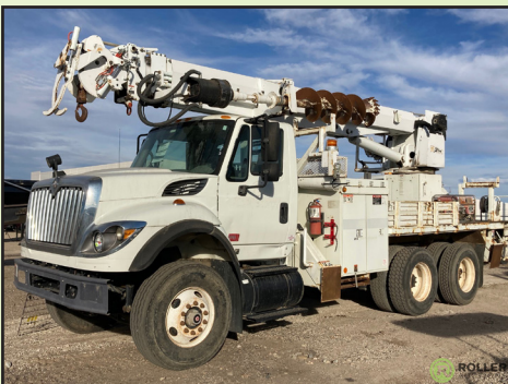
2009 INTERNATIONAL 7600 DIGGER DERRICK TRUCK W/ ALTEC BOOM