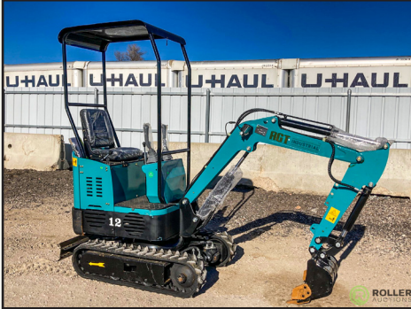
2021 AGROTK YM 12 UNUSED MINI EXCAVATOR