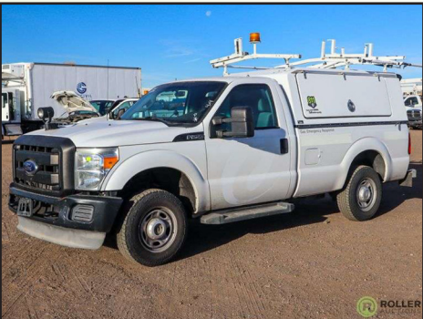
2012 FORD F250 4WD PICKUP

2006 International 4400 S/A Bucket Truck, DT466 Automatic, Spring Suspension, Terex Hi-Ranger 5TC-52 Boom, 52' Platform Height, Front & Rear Hydraulic Stabilizers, 13' Utility Box