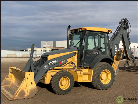
2011 JOHN DEERE 310SJ 4WD LOADER/BACKHOE, EXTENDAHOE