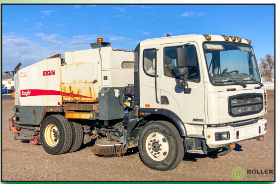
2012 ELGIN EAGLE STREET SWEEPER, COUNTY UNIT

Inspection: January 17th & 18th from 8:15 a.m. to 4:45 p.m.