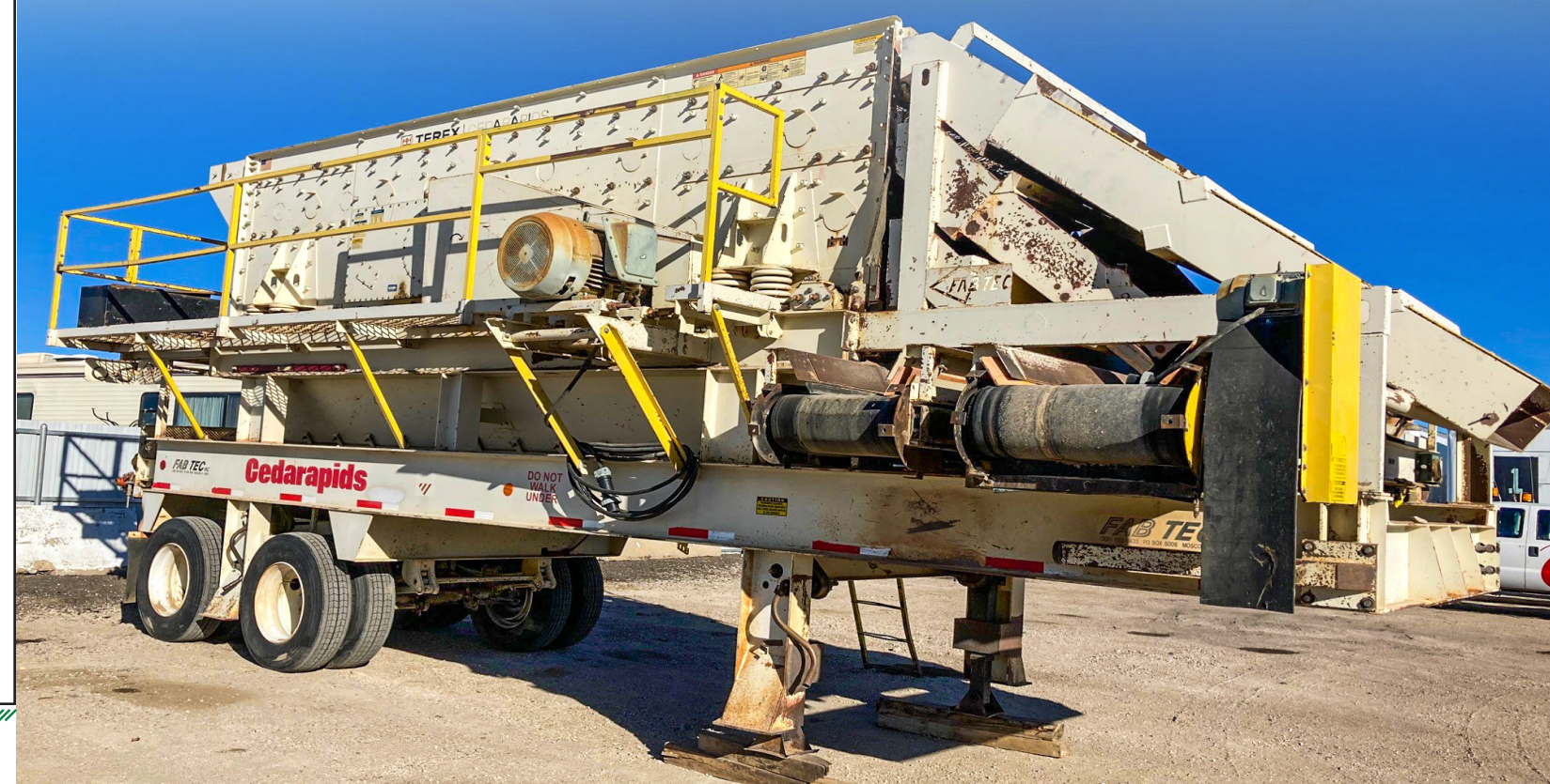
2006 FAB-TEC 6X20 PORTABLE SCREENING PLANT, 3-DECK, COUNTY UNIT

Internet Only Auction • Bidding Available at: www.RollerAuction.com/construction