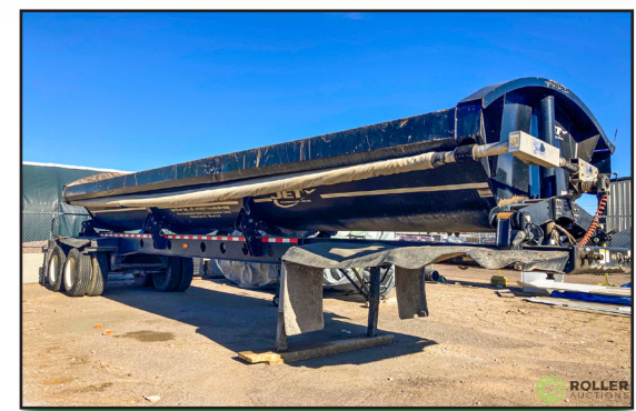
2015 JET T/A SIDE DUMP TRAILER W/AIR RIDE

PRESORTED FIRST CLASS MAIL U.S. POSTAGE PAID DENVER CO PERMIT # 4033