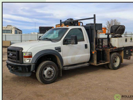
2008 FORD F550 4WD SUPER DUTY SERVICE TRUCK