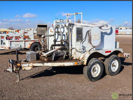
T/A OIL RECLAIMING TRAILER