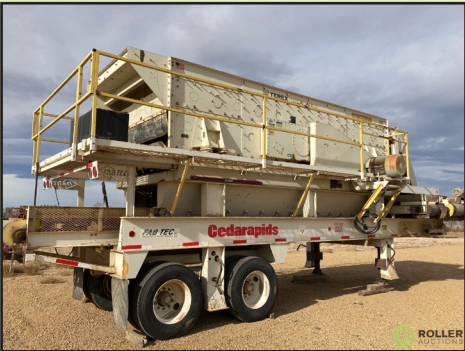
2006 FAB-TEC 6X20 PORTABLE SCREENING PLANT, 3-DECK, COUNTY UNIT