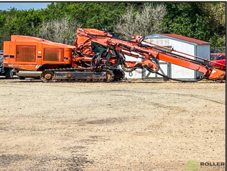
1998 TAMROCK PANTERA 900 CRAWLER ROCK DRILL

Reliance T/A End Dump Trailer, 24' Length, Spring Suspension, Frameless, High Liftgate, Electric Tarp