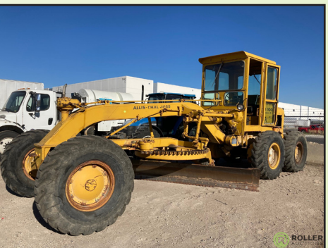
ALLIS CHALMERS M100B MOTOR GRADER