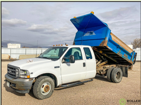
2003 FORD F350XL LANDSCAPE DUMP TRUCK