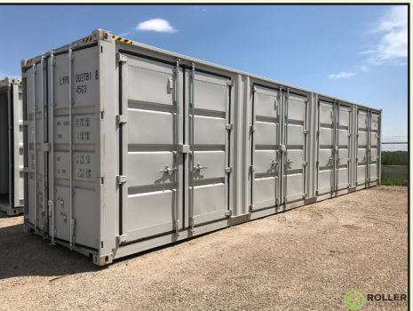
NEW 40 FT. STEEL STORAGE CONTAINER