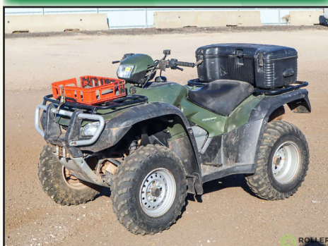
2005 HONDA TRX500FM 4WD ATV