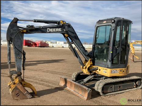
2006 JOHN DEERE 35D MINI EXCAVATOR W/ 1651 HOURS