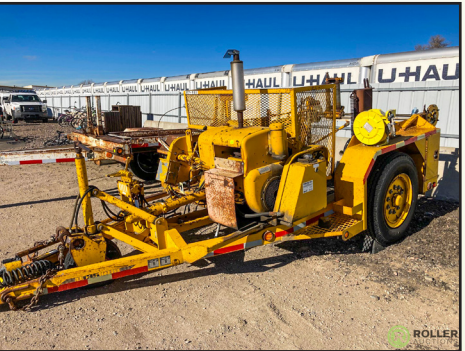
HOGG DAVIS S/A TENSIONING TRAILER

(4) New Kivel Trailer Mover Attachments To Fit Skid Steer Loader