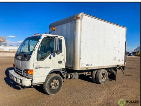
2004 ISUZU NPR S/A BOX TRUCK, DIESEL