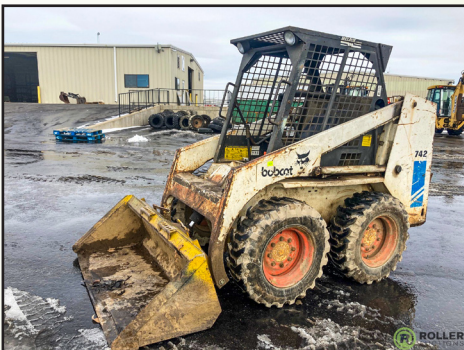
BOBCAT 742 SKID STEER LOADER