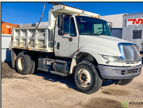
2007 INTERNATIONAL 4400 S/A DUMP TRUCK W/ DT466