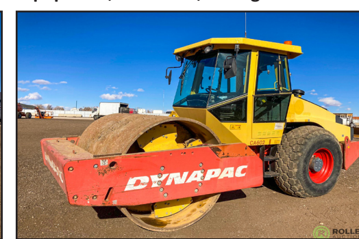
2007 DYNAPAC CA602D VIBRATORY ROLLER, COUNTY UNIT