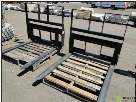
NEW FORK ATTACHMENTS TO FIT SKID STEER LOADER