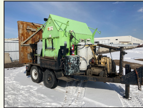
2005 RAY-TECH MINI COMBO INFRA-RED TRAILER