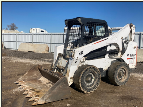
2013 BOBCAT S750 SKID STEER LOADER