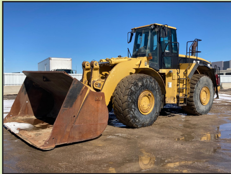
2001 CATERPILLAR 980G WHEEL LOADER