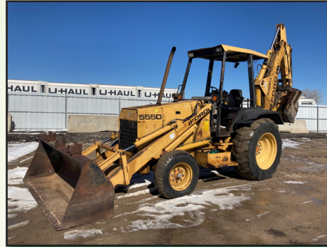
FORD 555D LOADER/ BACKHOE, EXTENDAHOE