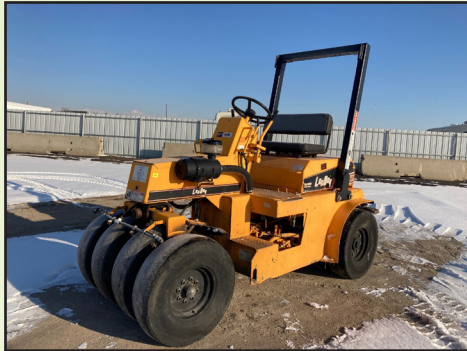
2001 LEEBOY 420 9-WHEEL PNEUMATIC ROLLER