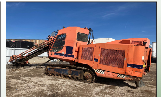
1998 TAMROCK PANTERA 900 CRAWLER ROCK DRILL