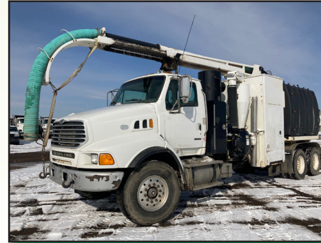
2009 STERLING VACUUM TRUCK W/ SUPER PRODUCTS BED