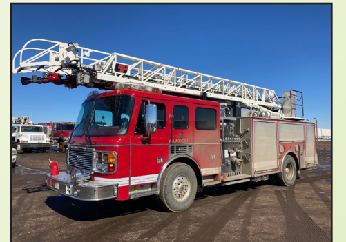
2002 AMERICAN LAFRANCE EAGLE QUINT LADDER TRUCK, MUNICIPALITY UNIT