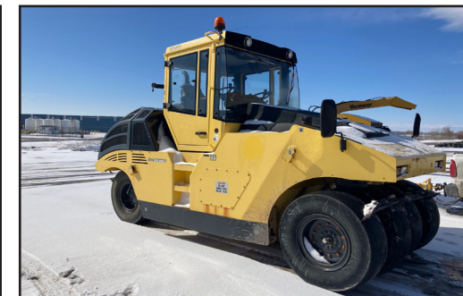
2009 BOMAG BW27RH 8-WHEEL PNEUMATIC ROLLER, COUNTY UNIT