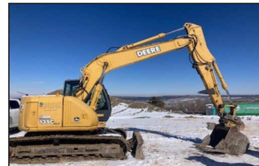
2008 JOHN DEERE 135C HYDRAULIC EXCAVATOR

Motor Grader, Wheel Loaders, Loader/ Backhoes, Hydraulic Excavators, Skid Steer Loaders, Crawler, Compaction Equipment, Truck Tractors, Telescopic Forklifts, Trenchers, Ready Mix Trucks, Dump Trucks, Utility Trucks, Flatbed Trucks, Bucket Trucks, Fire Trucks, Equipment Trailers, Rock Drill, New Attachments, Pickups & More!