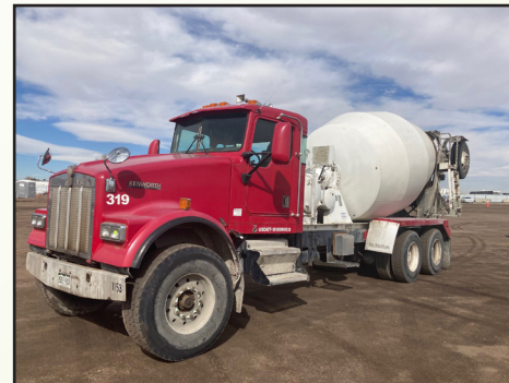
2000 KENWORTH W900B READY MIX TRUCK