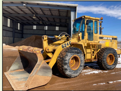
1997 JOHN DEERE 624G WHEEL LOADER, COUNTY UNIT

Vermeer V5750 Ride-On Trencher, Deutz Diesel, 64" Backfill Blade, Front Counterweights, Crumber, Hour Meter Reads: 2965, S/N: 1VRM082Z5V1000380