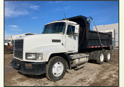
2001 MACK CH613 T/A DUMP TRUCK