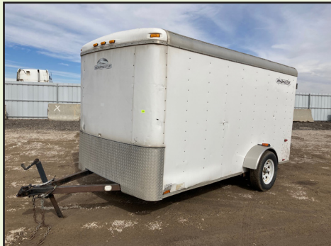
ROADMASTER 6 FT. BY 12 FT. ENCLOSED TRAILER