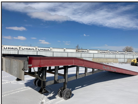
2021 MEDLIN 10-TON PORTABLE RAMP, 8 FT. BY 39 FT.