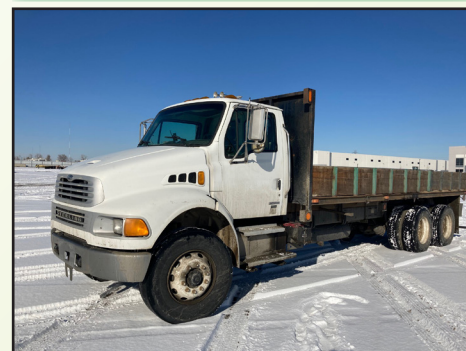
2005 STERLING ACTERRA FLATBED TRUCK W/ MERCEDES DIESEL