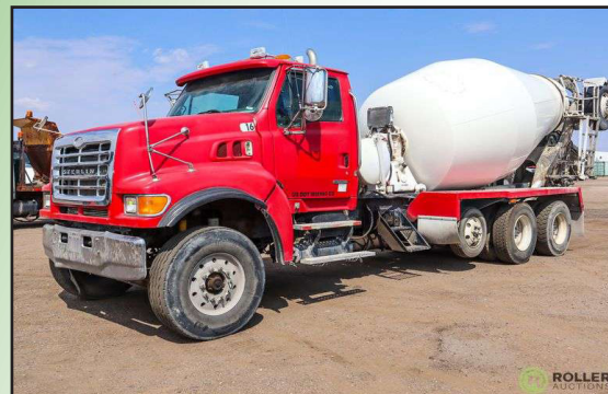
2007 STERLING L9500 READY MIX TRUCK

Inspection: March 14th & 15th from 8:15 a.m. to 4:45 p.m.