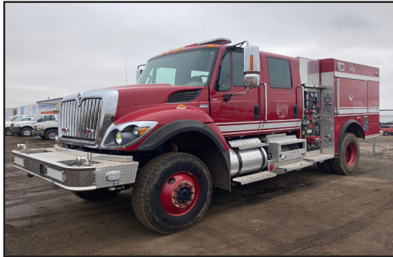
2015 INTERNATIONAL 7400 4WD PUMP TRUCK, CITY UNIT

PRESORTED FIRST CLASS MAIL U.S. POSTAGE PAID DENVER CO PERMIT # 4033