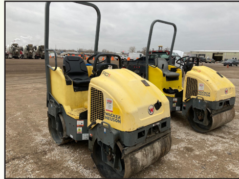
WACKER RD12A SMOOTH DRUM ROLLERS