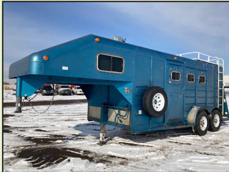
W-W 20 FT. HORSE TRAILER W/ LIVING QUARTERS