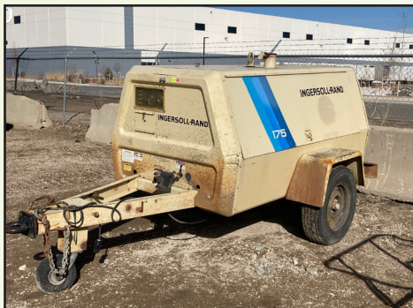
INGERSOLL RAND 175 CFM TOWABLE AIR COMPRESSOR