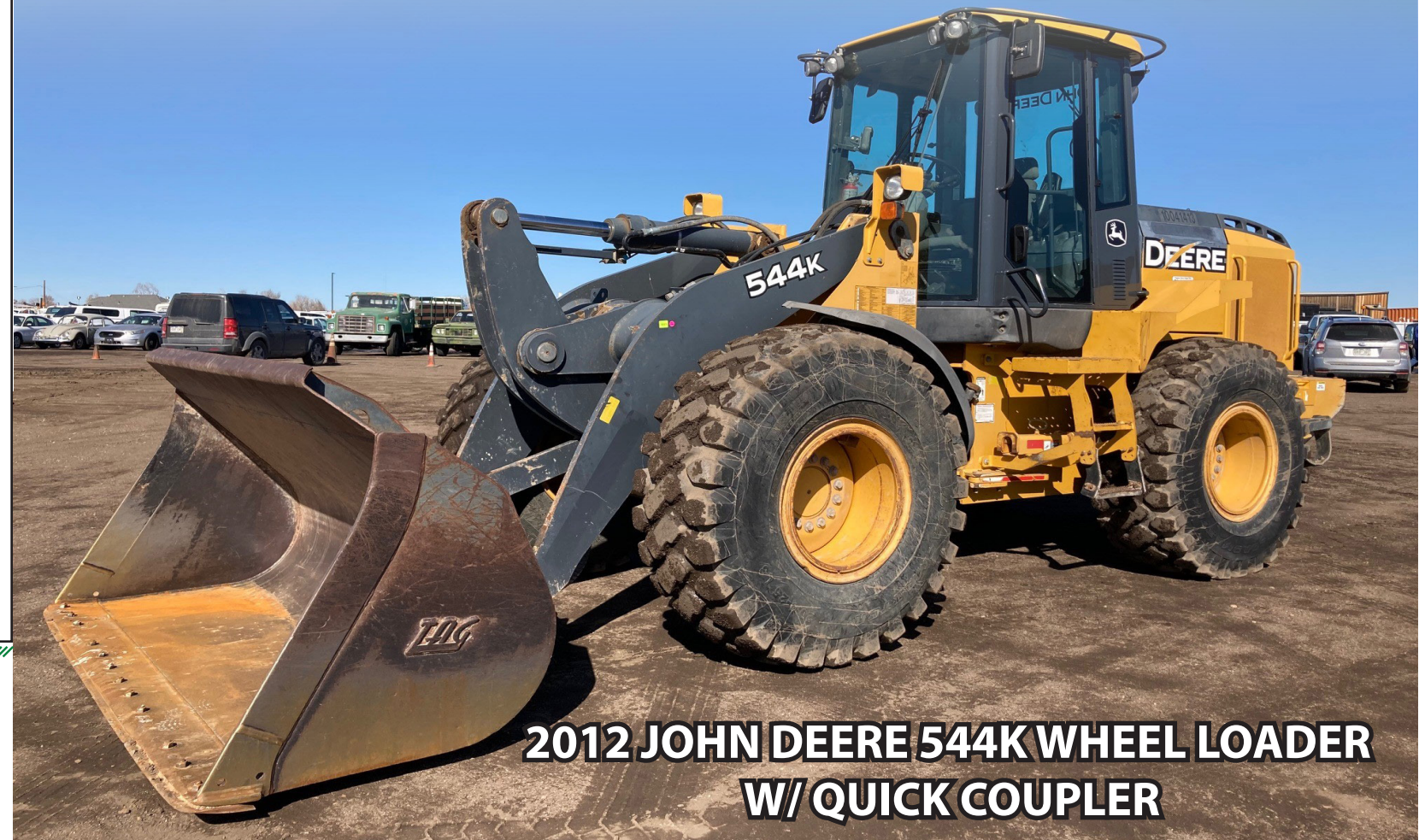
2012 JOHN DEERE 544K WHEEL LOADER W/ QUICK COUPLER

Internet Only Auction • Bidding Available at: www.RollerAuction.com/construction