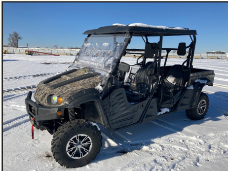
2017 CUB CADET CHALLENGER 750 CREW 4WD UTV