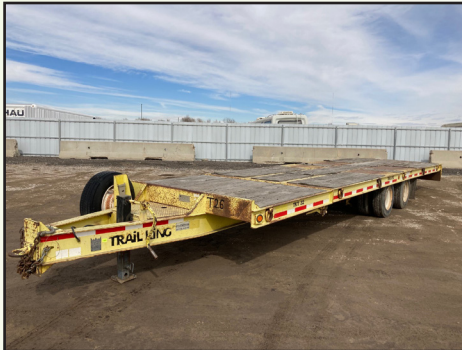
2000 TRAIL KING TKT32 TILT DECK EQUIPMENT TRAILER