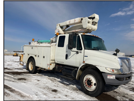
2008 INTERNATIONAL 4300 BUCKET TRUCK W/ TEREX 41 FT. BOOM