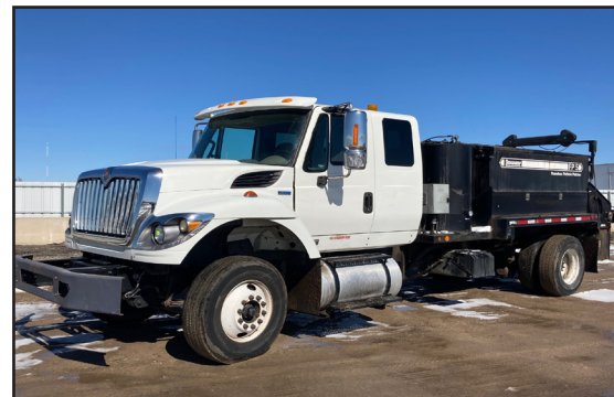
2012 INTERNATIONAL 7600 ASPHALT PATCH TRUCK