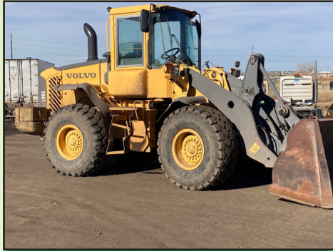
2006 VOLVO L90E WHEEL LOADER W/ QUICK COUPLER