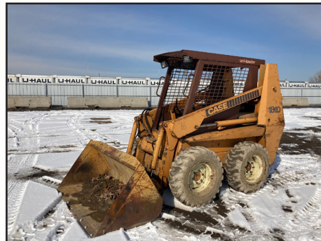
CASE 1840 SKID STEER LOADER