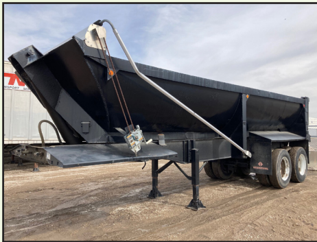
FRUEHAUF 24 FT. T/A END DUMP TRAILER