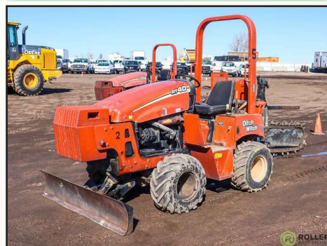
2007 DITCH WITCH RT40 RIDE-ON TRENCHER