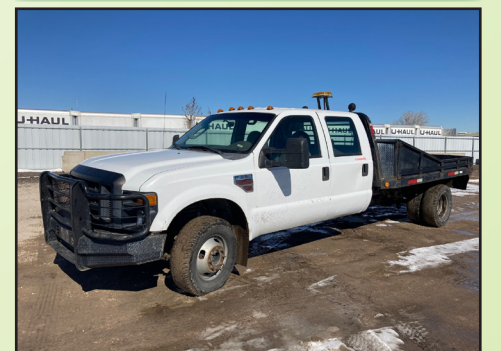
2008 FORD F350XL 4X4 CREW CAB FLATBED TRUCK