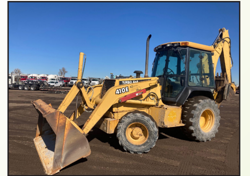
JOHN DEERE 410E 4WD LOADER BACKHOE COUNTY UNIT

2008 Ford F350XL Super Duty Crew Cab 4x4 Flatbed Truck,