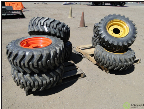
PARTIAL VIEW OF NEW SKID STEER TIRES