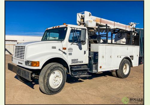
2001 INTERNATIONAL 4900 DIGGER DERRICK TRUCK W/ TEREX BOOM