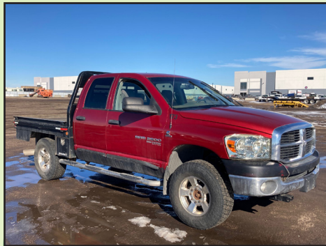
2006 DODGE RAM 2500 4X4 CREW CAB FLATBED TRUCK